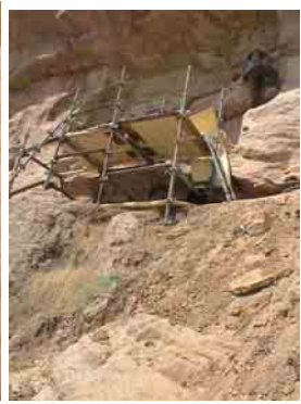
Building the platform.

The survey involved building a two to three metre high platform several hundred metres up a steep slope on the mountain side, enabling Philippe Martinez, the photographer, to work with his equipment. The team had only approximately 1 metre in which to work and erect the platform. It took several days to erect the structure and clean the relief for photographing and the work was also delayed by heavy rain for several days. Carpenters from Pul-i-Khumri were hired to build the platform and labourers from the village were hired to make the area on which the platform would be built and the track in the immediate vicinity wider and more safe to work on. The men from the village and the carpenters worked in difficult conditions hundreds of feet up the steep mountain side with little room and did so very successfully. This enabled the 3-D photography to proceed without problems and under safe conditions.