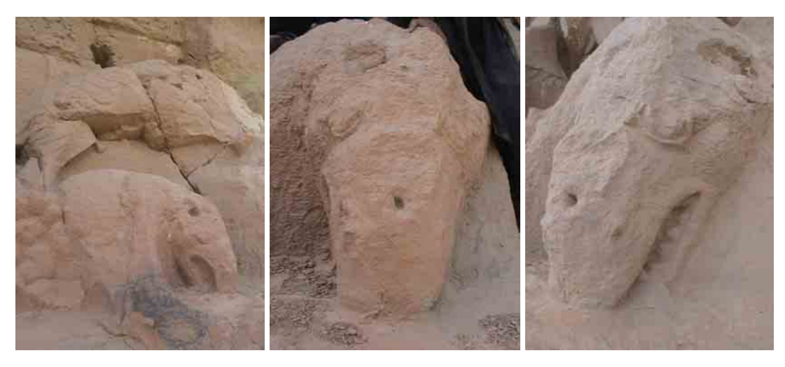
Fleeing animal with scaled armour.

Sassanid Kings Shapur I & II to expand their influence in Afghanistan during the 3<sup>rd</sup> and fourth centuries AD.