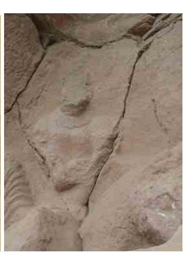
Detail of middle section.