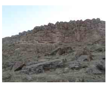
Southern entrance to the valley from the site. Village of Shamark from the south-east. Cliff where relief is located from the east.

Dr. Lee traveled to the village of Shamarq, approximately 45 minutes drive from Pul-i-Khumri (capital of Baghlan Province) along a potholed dirt road. Pul-i-Khumri lies approximately equidistant between this site and the great Kushan temple founded by Kanishka at Surkh Kotal. The site is located a few minutes walk from the village on the first tier of three natural terraces that form the structure of the cliff. Dr. Lee was guided by the local villagers several hundred feet up the snow covered mountain side and along a precarious icy path at times barely one foot wide.