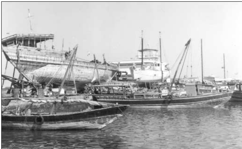
Photo 2. Zarooks, as seen here in Djibouti harbour, sometimes carry smuggled goods.