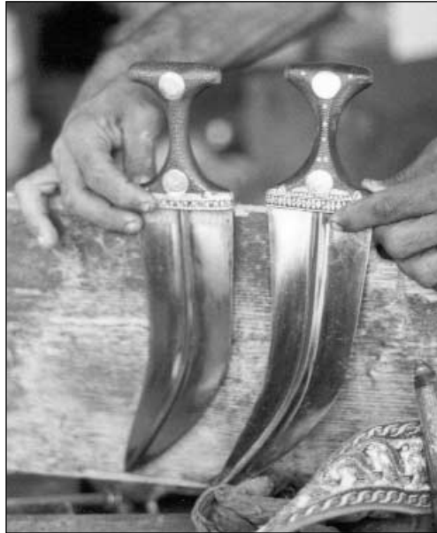
Photo 4. Jambiyas with rhino horn handles are displayed in Hodeidah.

prohibited throughout South Yemen (Renaud Detalle, pers. comm., 2000).