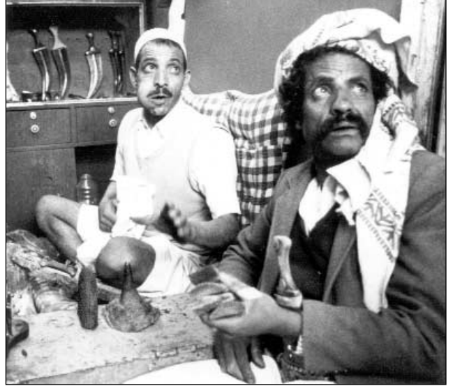
Photo 1. Rhino horns such as the two seen here in Sanaa's old souk in 1990 would not be on view today. The trader in the front is holding four roughly carved rhino horn handles.

These dhows carry many smuggled items from Djibouti to Yemen, including whisky and electronic goods. The sailors often cross at Bab al Mandab, the narrowest point where the Red Sea meets the Indian Ocean, and they land near Mocha on the Yemen coast. The three horns known to have reached Sanaa in 1998 were smuggled into Yemen by this route. A Sudanese businessman brought the horns from Sudan to his office in Djibouti, hidden in sacks of foodstuff (such as sesame seeds and groundnuts). A member of the main jambiya family went to Djibouti and bought the horns for $1,200 a kg. This person gave the horns to a boat owner and flew back to Yemen, probably meeting the boat owner at a pre-planned place near Mocha, according to confidential sources in Yemen.