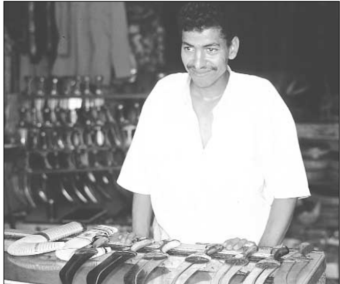
Photo 5. The young owner of the one jambiya shop in Aden displays a variety of jambiyas for sale.