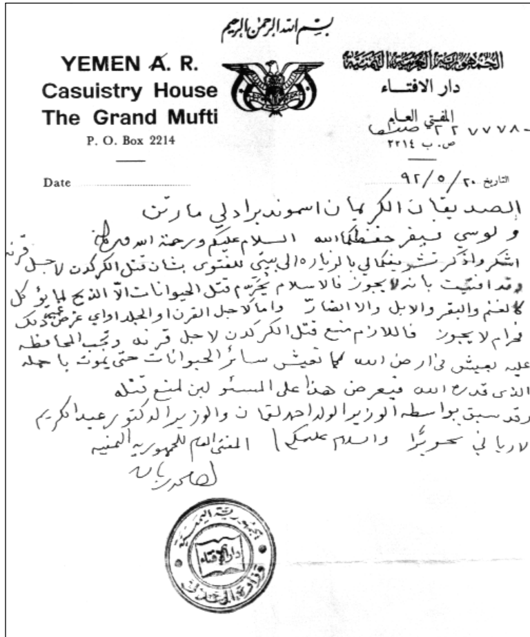
Photo 6. The Grand Mufti of Yemen produced this religious edict in 1992, following a meeting with the authors, to try to stop Yemenis from using rhino horn for dagger handles. The edict states that killing rhinos for their horns is not allowed by Islam.