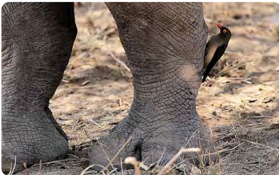
White rhinoceros ( Ceratotherium simum ).

The white rhinoceros Ceratotherium simum and black rhinoceros Diceros bicornis ranging in Africa are listed in Appendix I, except for the white rhinoceros populations of Eswatini and South Africa which are listed in Appendix II for trade of live animals and hunting trophies.