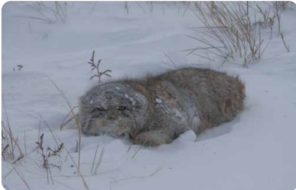
Pallas's cat ( Otocolobus manul ).

On the Trail n°39 Black market feline parts quotation from media or official sources The values were estimated at the time of the seizures