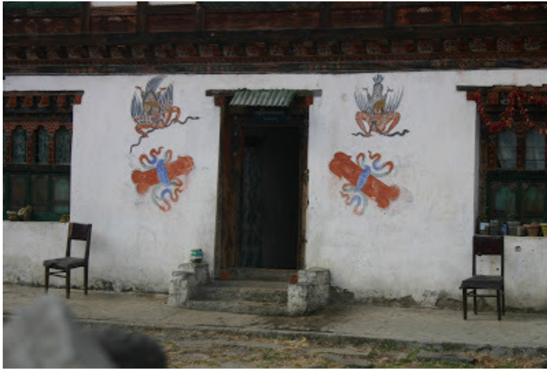
Symmetry. Sort of.