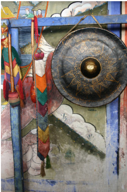
Tableau at an old temple. The shield is made of rhino hide.