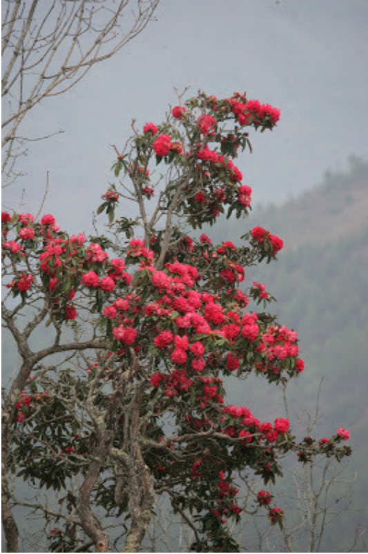
Rhododendron. It's the season now, and there are so many colors. Bhutan is full of Rhododendron forests.