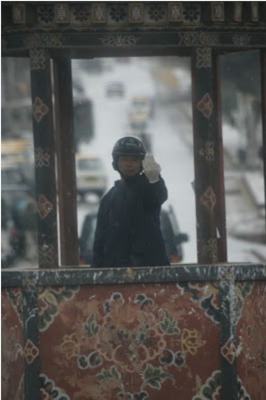
A rainy day in downtown Thimphu.