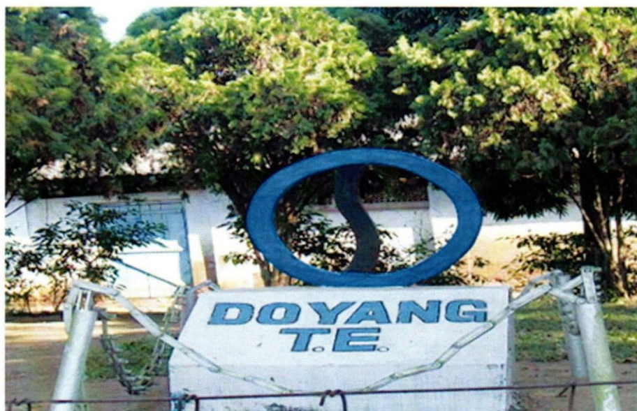
FIG. 3 Logo of Doyang Tea Estate, Grob.Tea Company Ltd, Haute Street, Topsia Road, Kolkata-700048, India.

E.P. Gee was a renowned British born naturalist and wildlife conservationist of India. He had joined the Doyang Tea Estate in the year 1946 as Assistant Manager. At the time of his joining the tea garden as Assistant Manager, the author of this book was about two years old. The Doyang Tea Estate is at a distance of about six kilometers from the author's residence at Barpatharua village on the way to Golaghat Doyang Tea garden Road. E.P. Gee graduated from Cambridge University, U.K.