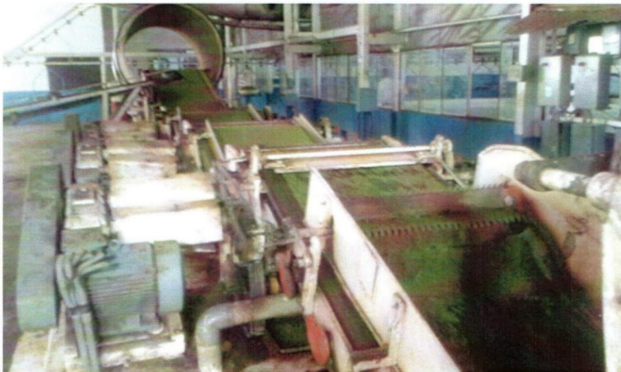
FIG. 9 Tea processing Factory of Doyang Tea Estate