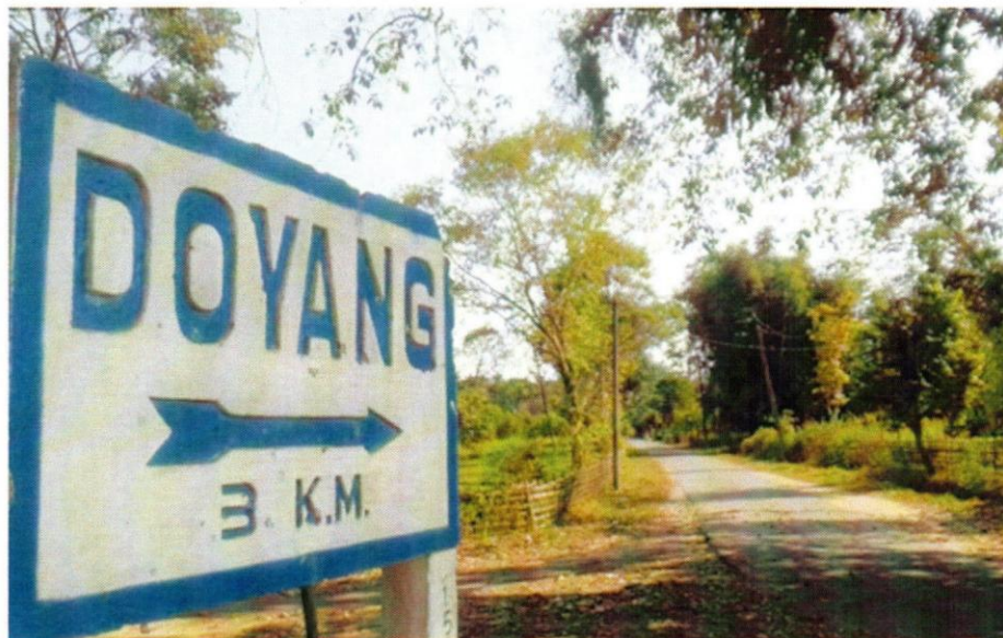
FIG. 2 Road to Doyang Tea Estate