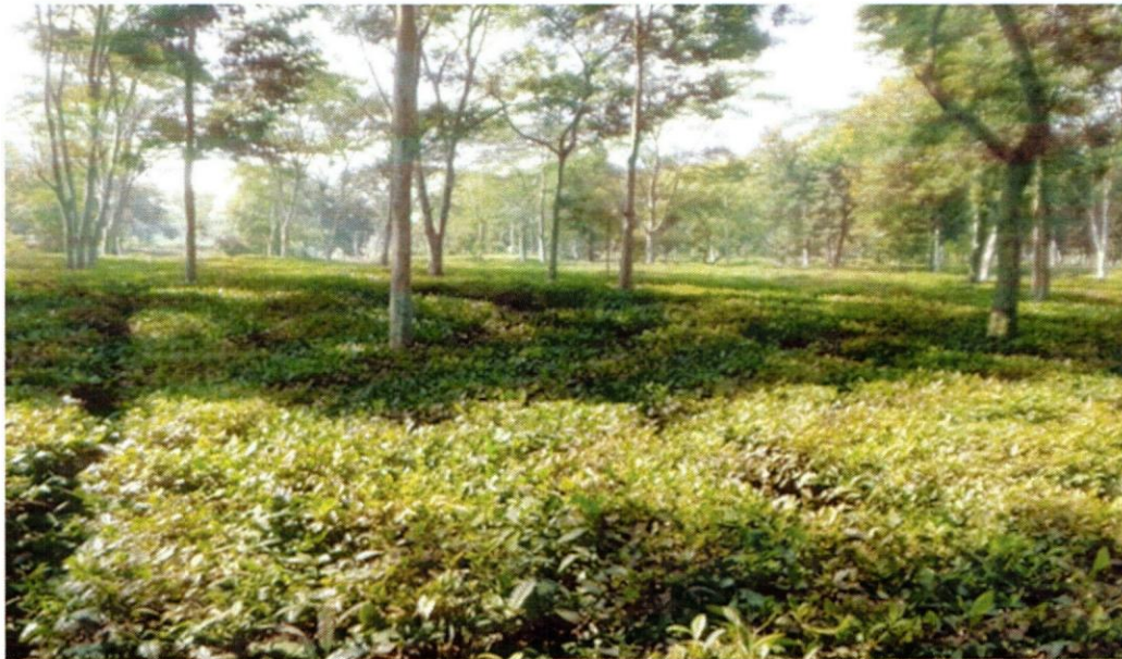
FIG. 4 Direct view of a site of Doyang Tea Garden.