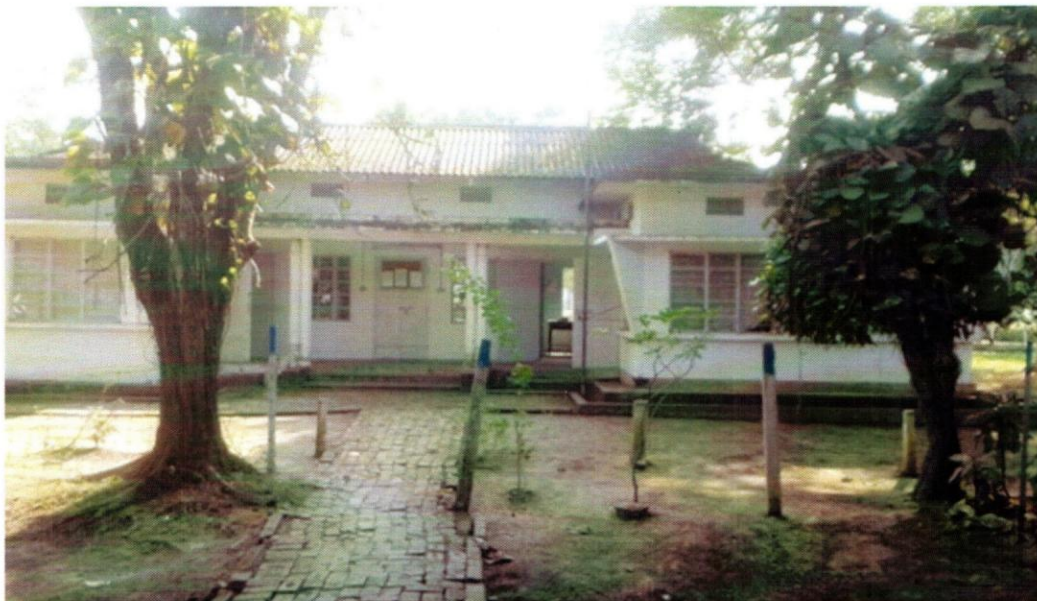
FIG. 5 Office of the Doyang Tea Estate, Oating, Golaghat