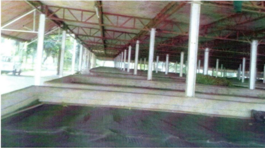
FIG. 8 Tea House of Doyang Tea Estate