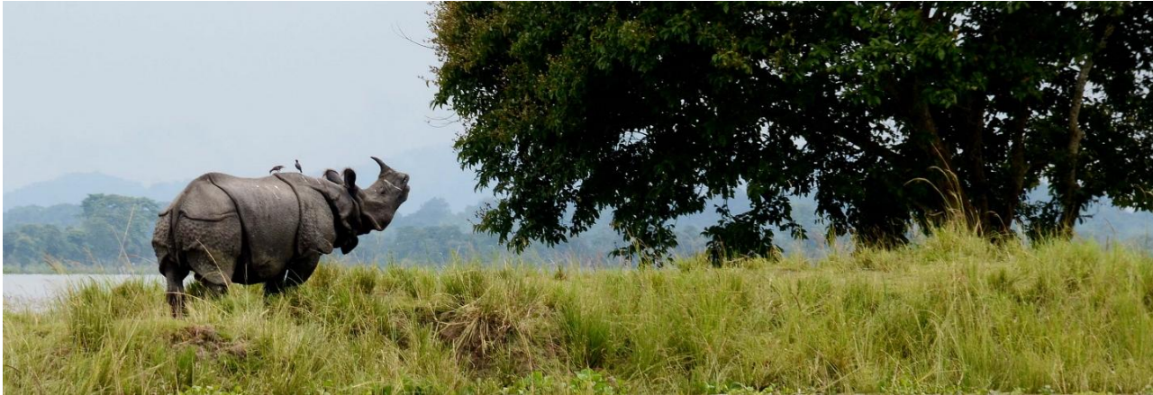
An adult male one-horned rhino at the Kaziranga National Park in Assam shelters on high land during floods