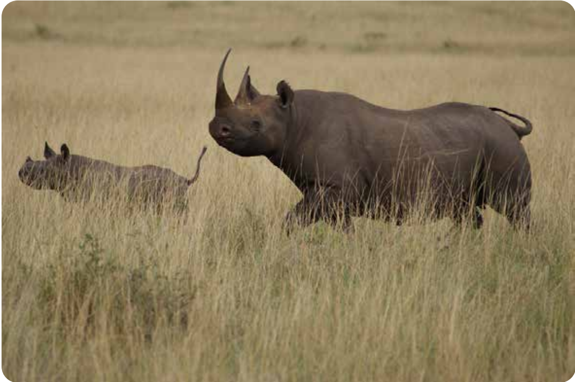
Black rhinoceroses ( Diceros bicornis).

Portugal Posts English, July 22, 2022. 34