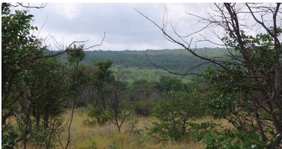
Figure 4. Kruger's expansive, dense terrain. Photo taken by author, 2012, near the Mozambican border. (Color figure available online.)

topography. At almost 2 million hectares and taking two to three days to cross on foot from east to west, Kruger's landscape is indeed vast. In addition, much of the park, including much of the border, is a heavily forested landscape of mixed woodland and Mopani bushveld that is especially thick with vegetation in the rainy season (Figure 4). Much of the border also includes the undulating and rocky Lebombo Mountains, which makes for "ankle-breaking" patrols. These qualities together leave the park difficult to patrol, enabling rhino poaching teams to slip in and out of the park often undetected (Interviews 2012). Due to budget restrictions, as of mid-2013, Kruger had fewer than 500 rangers, which, due to the park's size, amounts to approximately one ranger per 4,000 hectares. These qualities of expansiveness and obscurity, in fact, frequently characterize conservation areas around the world, making them difficult to patrol under normal conditions, let alone during times of commercial poaching.