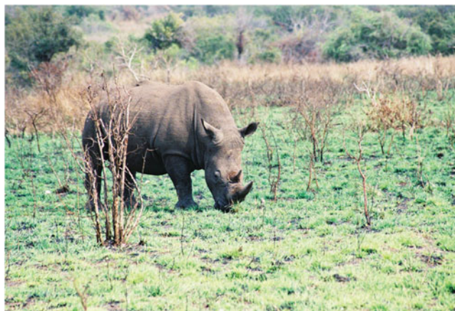
Figure 2. One of Kruger's charismatic megafauna: the rhino. Photo by author, 2004. (Color figure available online.)

South Africa's Kruger National Park is the country's, and indeed one of the continent's, most iconic and visited protected areas, one teeming with charismatic megafauna like the rhino (Figure 2). After a successful campaign to reintroduce both white rhinos ( Ceratotherium simum ) and black rhinos ( Diceros bicornis ) into the park beginning in the 1960s, South Africa is currently home to 83 percent of Africa's and 73 percent of the world's approximately 28,000 remaining rhino, with well over half of these residing in Kruger (Emslie, Milliken, and Talukdar 2012). Kruger is, in short, the world's single most important site of rhino conservation. After several decades of strong growth rates, by 2008 Kruger's rangers began to notice a drastic spike in rhinos shot and dehorned (Interviews 2009, 2012), with an unprecedented 606 lost in 2013 (Figure 3). Standing behind these numbers is a skyrocketing demand for rhino horn coming from Vietnam and increasingly China, where growing affluence has made