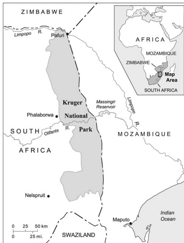
Figure 1. South Africa's Kruger National Park.

Taken together, these reflect a larger pattern of what I call green militarization , or the use of military and paramilitary (military-like) actors, techniques, technologies, and partnerships in the pursuit of conservation. Set against a surprising lack of scholarly