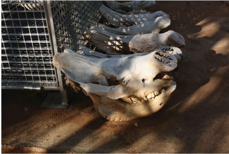
Figure 5. Kruger's vast and dense terrain articulate with the biophysical properties of rhino horn (quick and easy removal) to confound antipoaching efforts. The clean cut across the nose of the skull in the foreground indicates the rhino was killed for its horn. Photo by author, 2009, at one of Kruger's section ranger headquarters. (Color figure available online.)

Group, a state-owned aerospace and defense conglomerate that has loaned an unmanned aerial vehicle, Seeker 2, a drone, to SANParks to assist its anti-poaching efforts. "Details of the intervention," we are told, "cannot be released for security considerations and other key operational sensitivities" (SANParks and Denel 2012). At a minimum, this "intervention" brings military drone technology into Kruger—technology that can potentially lessen the problems of distance and invisibility posed by the park's expanse and dense topography. In a far more well-publicized partnership, SANParks has received additional military aerial surveillance technology from the Ichikowitz Family Foundation, which is the charitable arm of the Paramount Group, itself the continent's largest privately owned defense and aerospace company. Their donation consists of a Seeker Seabird specialist reconnaissance aircraft equipped with a "FLIR Ball infrared detector [that] will deliver more enhanced and powerful observation capability to [Kruger's] rangers, making it very difficult for poachers to hide" (SANParks 2012a).