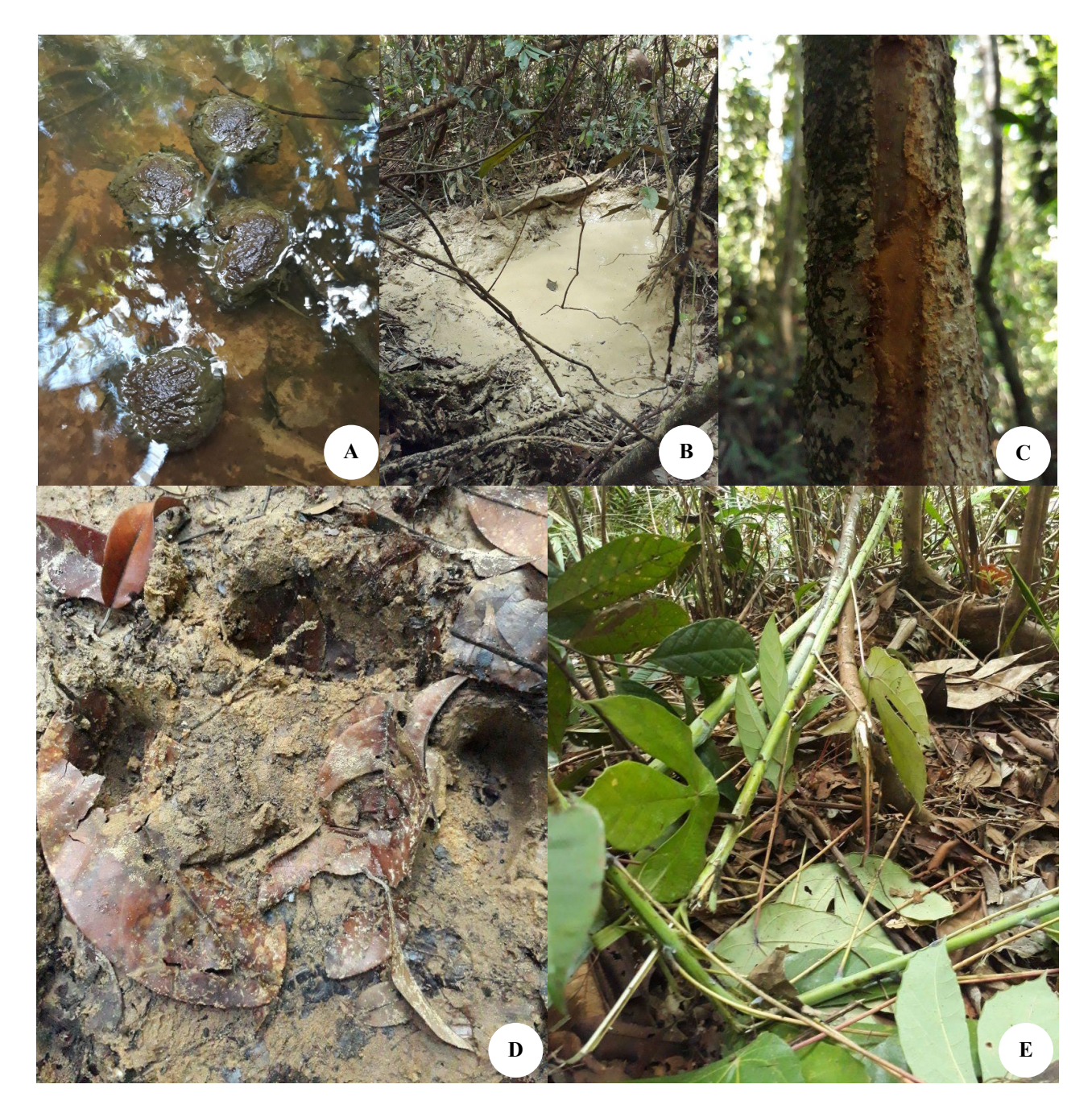
Figure 3. Signs of rhino presence in the Kutai Barat forest, East Kalimantan, Indonesia. A. Dung piles, B. Wallow, C. Scratch, D. Footprint, E. Bites mark on food plant

Salt licks are beneficial for many animals like rhinos since they can provide a source of minerals. Van Strien (1974) and Matsubayashi et al. (2006) revealed that three main minerals found in a salt lick are magnesium (Mg), potassium (K), and phosphate (P). Those minerals can help rhinos maintain their digestive system. Minerals such as sodium (Na) and potassium (K) are also useful in balancing ions in the body. To know the mineral content of rhino habitat in the Kutai Barat forest, we tested several locations such as rivers, wallows, and salt licks (Table 3). \Box