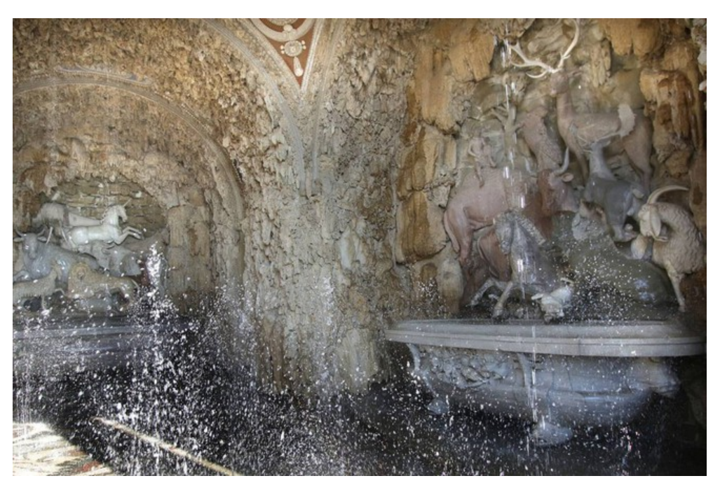
(English adaptation of basic text in Italian by Antonietta Bandelloni)