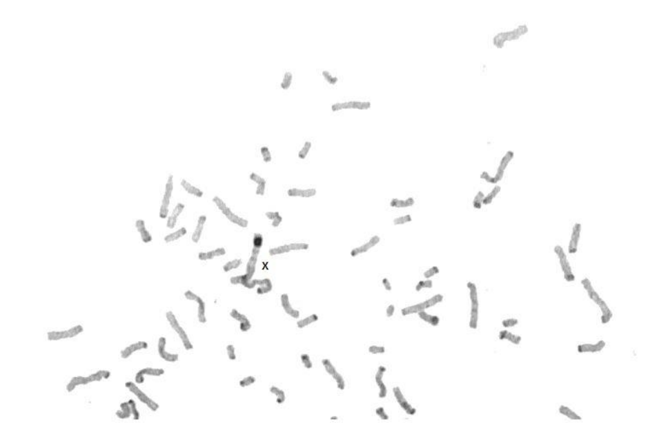
Figure S1. CTG banding of SR-iPSCs confirms large block of heterochromatin at the terminal end of the long (q) arm of the X chromosome. Related to Figures 1E and 1F.