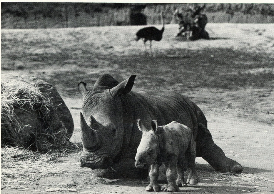
The fifth baby rhino (female SAN #7: 4-15-73) is shown at two days of age with her mother Sinamra.