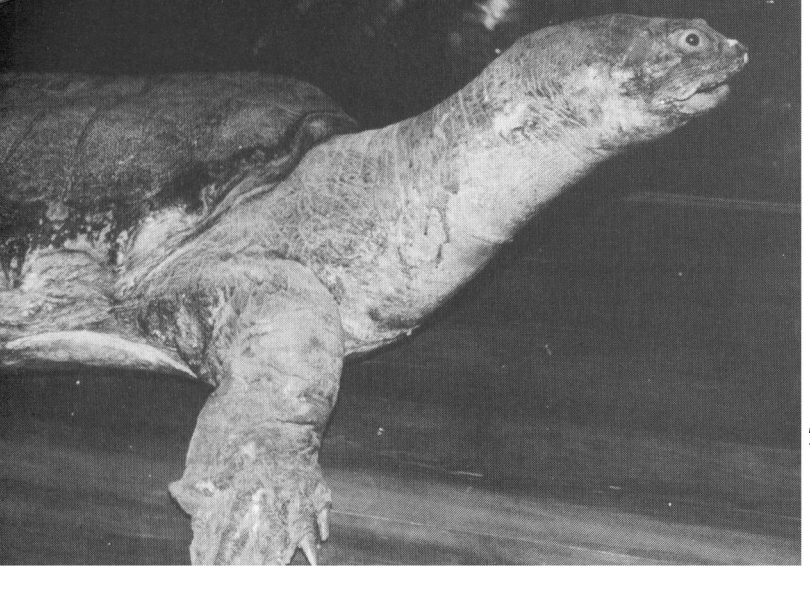
The enormous tortoise Pelochelys bibroni, weighing 550lb that emerged from the central lake in Hanoi City in 1926

extensive walks I saw only a few caged birds. At my hotel a visiting Russian had a 'cai-li', a lesser slow loris Nycticebus pygmaeus, which he hoped to take back to Russia. My Vietnamese friends were surprised that he had obtained it and knew of no market source for such animals. The hotel at Ha Long on the coast near the Chinese border had a healthy-looking macaque (Macaca nemestrina pig-tailed macaque) in an adequate cage which had been there for some years.