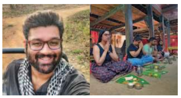
Founder of The Western Routes, a Pune-based travel company that focuses on culinary and cultural tours across India, he curates food trails across the country to popularise the concept of culinary tourism.