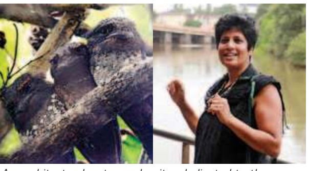
An architect, educator and writer dedicated to the cause of the environment, she has won numerous awards for architecture, writing with truth and integrity, and as an environmentalist.