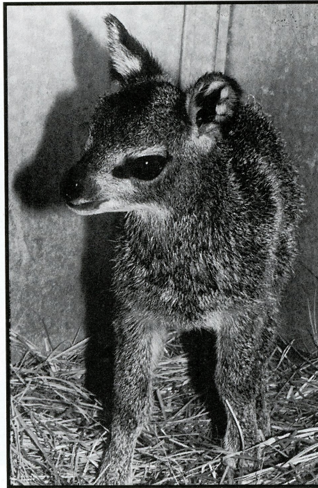
Klipspringer.