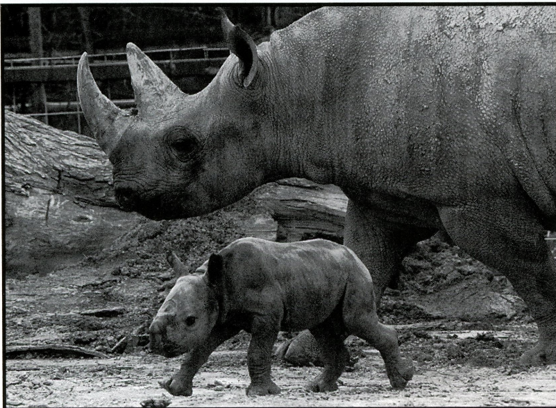
Black Rhino.