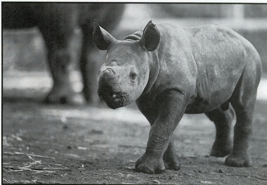
Black Rhinoceros Calf at the San Francisco Zoo

A male black rhinoceros was born at the San Francisco Zoo on 16 January. The calf is the 11th born to the 26-year-old female and the second sired by her nine-year-old mate. This calf is being raised by its mother, unlike the last calf born in 1995, who was successfully hand-raised by zoo staff after failing to nurse.