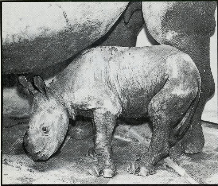
Black Rhino at Metro Washington Park Zoo