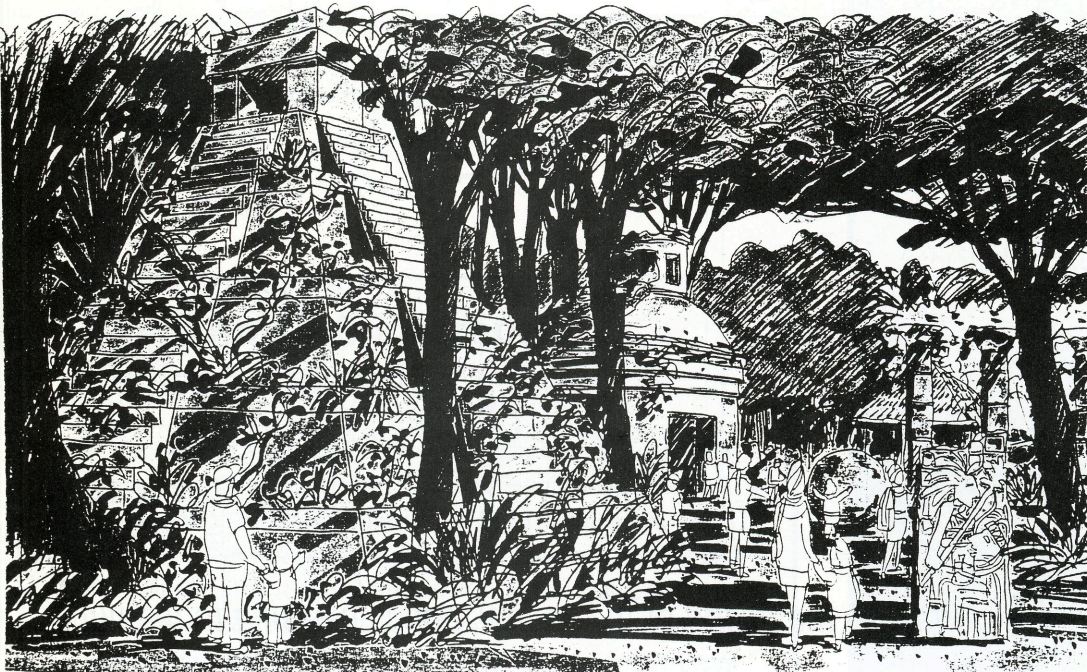
TROPICS OF THE AMERICAS, PALM BEACH ZOO