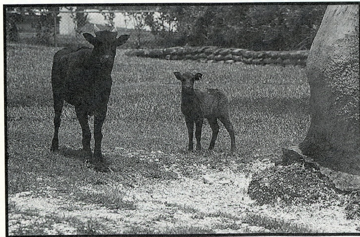
Anoa.