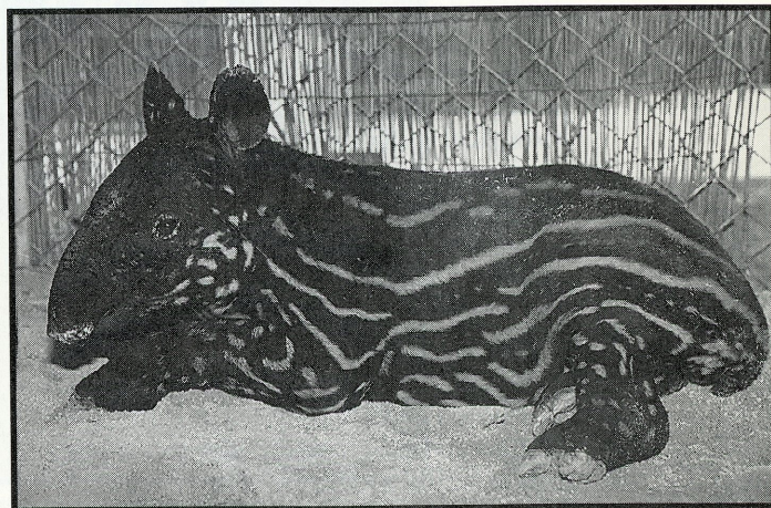
Malayan Tapir.