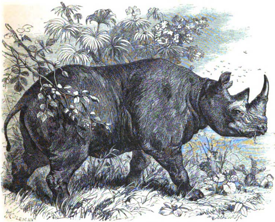
RHINASTER, OR BORELE.— Rhinoceros bicornis .

considered very unsafe to fire at the animal unless the hunter is mounted on a good horse, or provided with an accessible place of refuge. An old experienced hunter said that he would rather face fifty lions than one wounded Borele; but Mr. Oswell, the well-known African sportsman, always preferred to shoot the Rhinoceros on foot. The best place to aim is just behind the shoulder, as if the lungs are wounded the animal very soon dies. There is but little blood externally, as the thick loose skin covers the bullet-hole, and prevents any outward effusion. When mortally wounded the Rhinoceros generally drops on its knees.