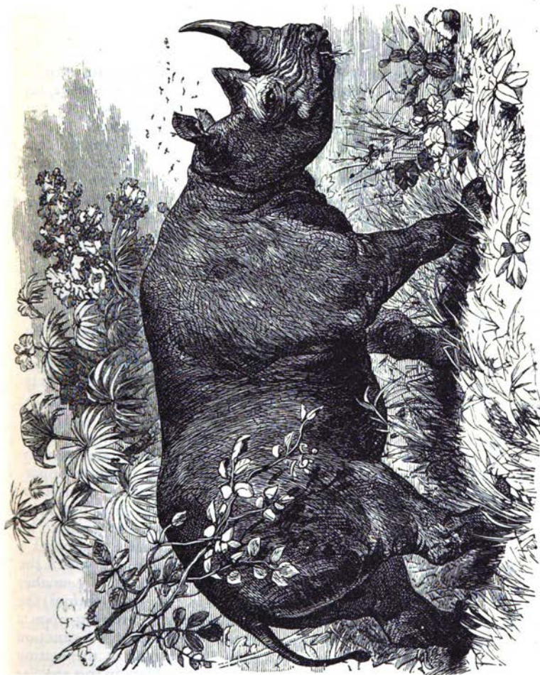
Fig. 36.—Two-horned African Rhinoceros ( R. bicornis ).

existing species of Rhinoceros—three in Asia and three in Africa; and they differ so much from each other that Dr. Gray has referred them to four generic divisions, which are quite as distinct as the