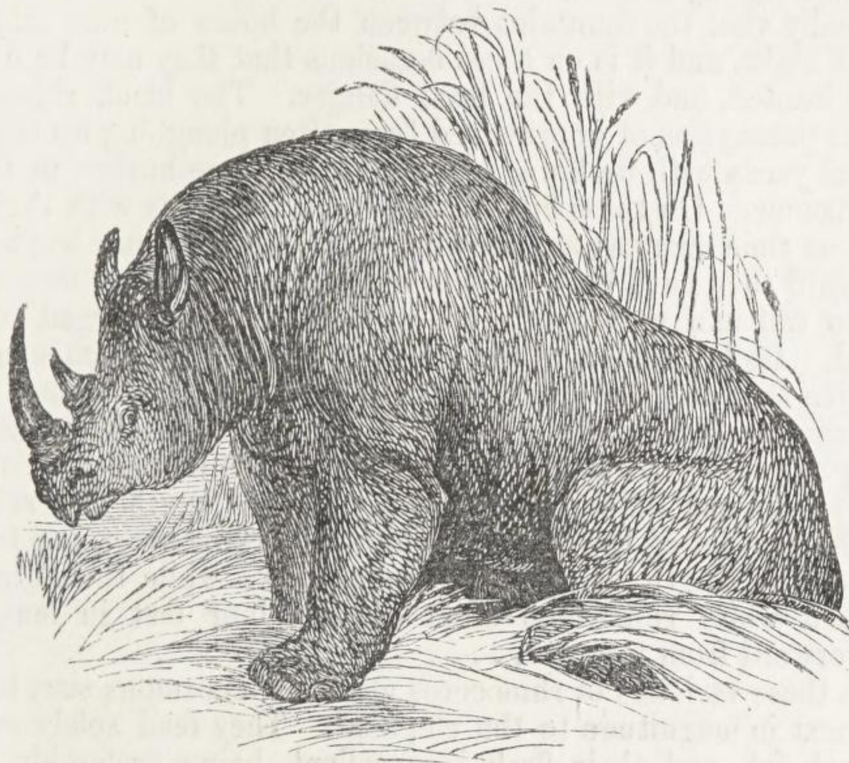
Bicornis (Lat. bis , twice; cornu , a horn), the Two-horned Rhinoceros , or Rhinaster .

consists almost entirely of the thorny branches of the wait-a-bit* thorns. Their horns are much shorter than those of the other varieties, seldom exceeding eighteen inches in length. They are finely polished with constant rubbing against the trees. The skull is remarkably formed, its most striking feature being the tremendous thick ossification in which it ends above the nostrils. It is on this mass that the horn is supported. The horns are not connected with the skull, being attached merely by the skin, and they may thus be separated from the head by means of a sharp knife. They are hard, and perfectly solid throughout, and are a fine material for various articles, such as drinking cups, mallets for rifles, handles for turners' tools, &c. &c. The horn is capable of a very high