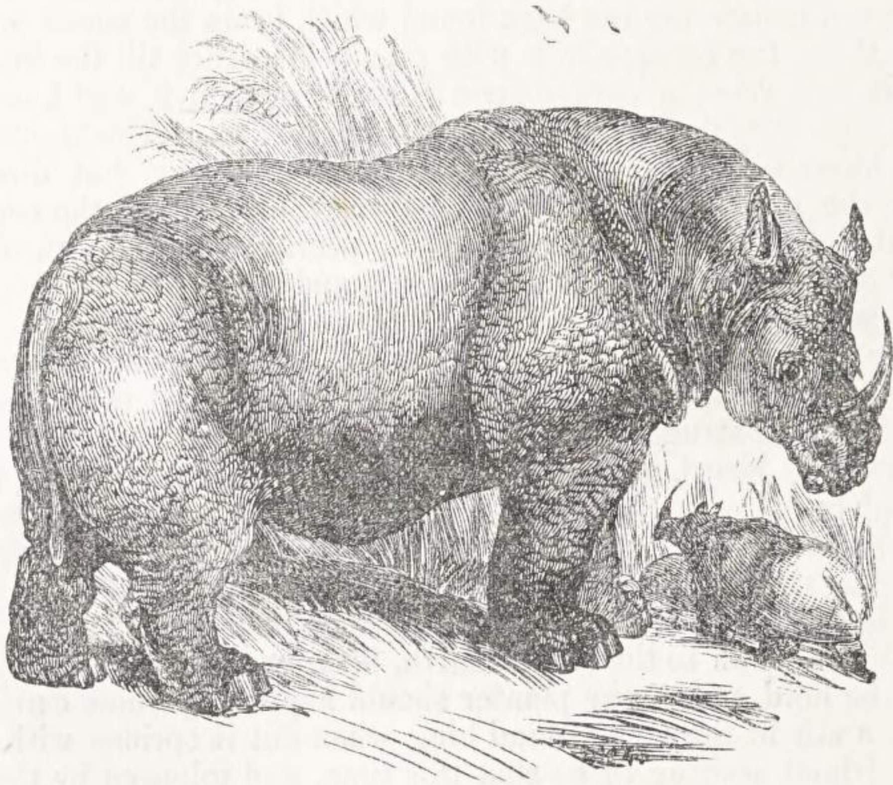
Unicornis (Lat. Unus , one; cornu , a horn), the Rhinoceros.

RHINOCÉROS.—(Gr. ῥίς , or ῥίς , a nose; κέρας , a horn.)