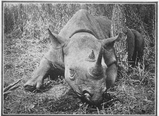
THE MIGHTY FALLEN This fine specimen of a rhinoceros was shot at Mtengula during a six months' trip from Beira to Nkata Bay, through Blantyre and the Nyasaland lakes.