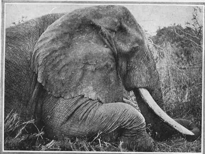
WITH TUSKS OF EIGHTY-FIVE POUNDS The head of a big elephant, shot at Fort Maguire.