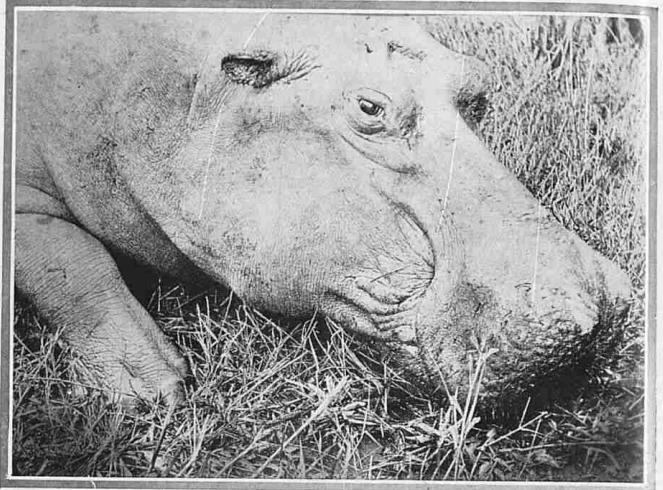
A FINE HIPPO HEAD The hippopotamus was shot at Monkey Bay, on Lake Nyasa.