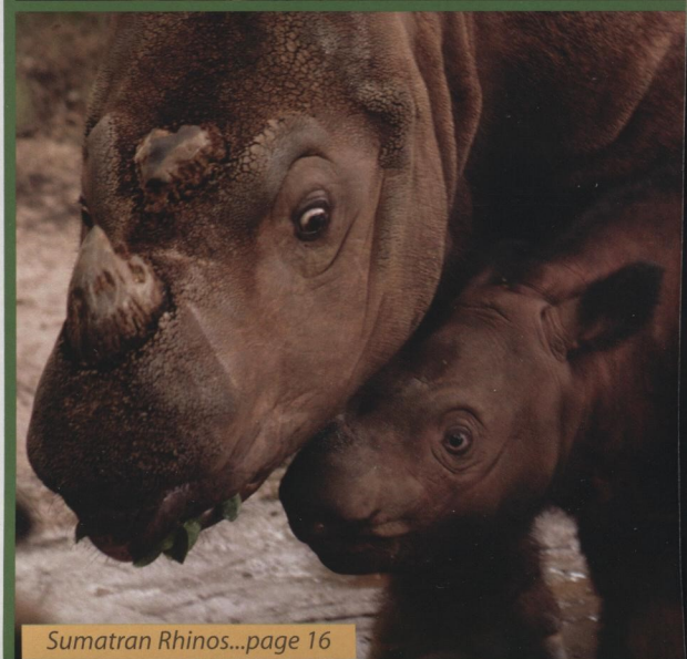
Sumatran Rhinos...page 16