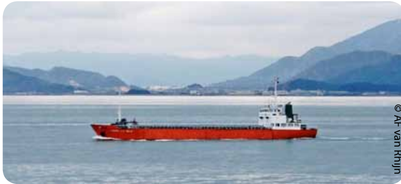
The Chang Jiang No.8 , March 2010, Kanmon Strait (Japan)

But this is the first time that the story of a substandard ship dedicated during her last voyage to the exclusive transport of 250 kg of rhinoceros horn is told and deciphered.