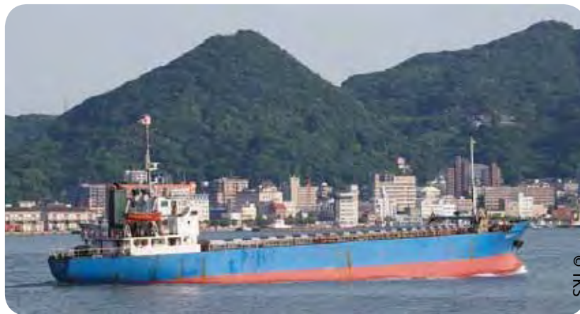
The Shun Fa 16 , June 2016, Kanmon Strait

The Tatsuhiro Maru n°5, 74 m long, 1,600 tons deadweight, was built in 1988 by Higaki shipyard in Imabari, Japan and started operating in 1989 under the Japanese flag. She connected Japan and China and began to be examined very closely by port State inspectors at the age of 12. Between the year 2000 and 2018, she accumulated 567 deficiencies and 9 detentions. Her bad reputation was well established among Tokyo Memorandum of Understanding member States. The fact that the Tatsuhiko Maru No.5 , which became the Chang Jiang No.8 in December 1998 and then the Shun Fa 16 in April 2013, was deflagged from Japan to Cambodia in 1998 and was flying the Sierra Leone flag in 2013 did not change anything. She even got collared in South Korea and acquired the high risk ship status in 2014. In March 2018 and May 2018, 21 deficiencies were reported in the ports of Chiba and Niigata (Japan).