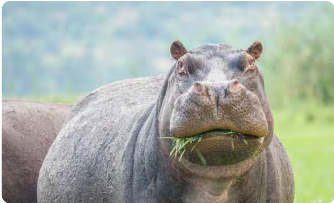
Hippopotamus ( Hippopotamus amphibius ). Photo s9-4pr