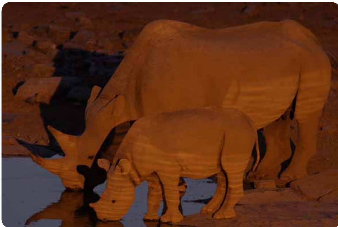
Black rhinoceroses ( Diceros bicornis ).

The white rhinoceros Ceratotherium simum and black rhinoceros Diceros bicornis ranging in Africa are listed in Appendix I, except for the white rhinoceros populations of Eswatini and South Africa which are listed in Appendix II for trade of live animals and hunting trophies.