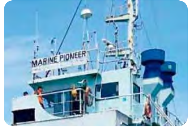
Marine Pioneer, June 2019

The Marine Pioneer is indeed about to become a pioneer and to our knowledge a unique case. She left Wenzhou, Zhejiang province, on March 5, 2019. This departure was spotted by Chinese investigators with all the more interest as “Wang” resides in Wenzhou when he is in China. The Marine Pioneer arrived in Mozambique in mid-April. Mozambique in southern Africa is one of the favourite countries for smugglers to ship ivory, pangolin scales, precious woods and rhinoceros horns by sea to Asia, particularly from the port of Pemba. Most of the horns originate from poaching in South Africa’s Kruger Park.