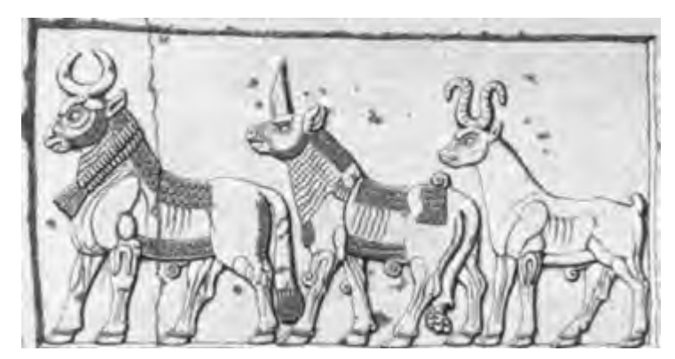
Fig. 4: Detail of the Black Obelisk of Shalmaneser III.

and adapted it by adding a horn. Admittedly, this points to a bull rather than a donkey as the Mesopotamian rhinoceros analogue of choice, but it is possible that a different person a thousand years earlier could have reached for a donkey instead