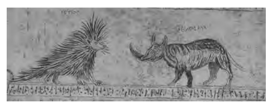
Fig. 6: Detail of the animal procession frieze in Tomb I at Marisa.

Another animal in the same frieze may also be a rhinoceros, though opinions differ as the label is not clearly preserved: