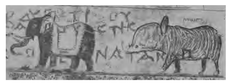
Fig. 5: Detail of the animal procession frieze in Tomb I at Marisa.

Later still, in the Hellenistic period tomb of Apollophanes at Tell Maresha in modern Israel, a very un-lifelike rhinoceros is depicted. This animal, which is clearly labelled in Greek pinokepoo "rhinoceros," is part of a procession of animals which seems to have been connected to the cult of Dionysus. It is evident from the faint second horn on the animal labelled rhinoceros that an African rather than an Indian animal is what the artist had in mind, 72 but it is equally clear that he had never seen one: