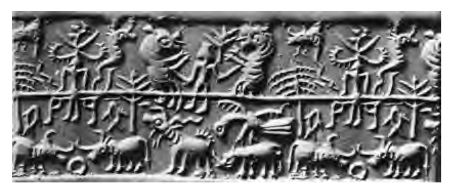
Fig. 3: de Clercq I 26. Cylinder seal of unknown date and provenience.

Another cylinder seal, this one made of agate, is slightly less straightforward.<sup>57</sup> It contains a scene featuring several exotic animals: