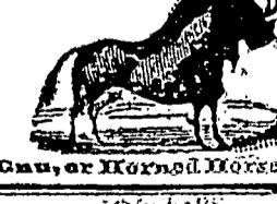
Gau, or Horned Horse.

This Menagerie and Aviary OCCUPIES 36 SPACIOUS CARRIAGES, WAGONS, &c. THE SAME ARE DRAWN BY 112 Splendid Gray Horses, AND SIXTY MEN, (Including 14 Musicians), Are required to complete its operations.