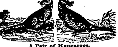
A Pair of Kangaroos.