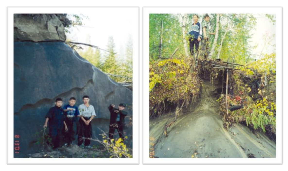
Fig. 13, 14. Permafrost. Appearance of the underground ice on the Rassypnoe route. Year 2001.