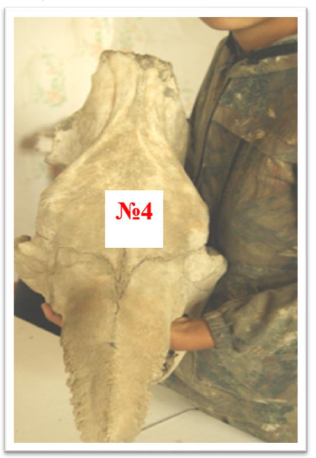
Fig. 28. The skull of the wolly rhinoceros No. 4.