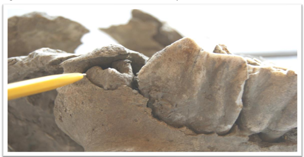
Fig. 25. The teeth construction of the skull of the woolly rhinoceros No. 4

The young paleontologists were particularly intrigued by the anatomical structure of skull No. 4. This skull differs greatly from the others. It should be noted that its size is smaller. Skull No. 4 has strongly pronounced cranial joints, which are absent in the other three. In No. 1, 2 and 3, the brain cases are strong and solid. The most important point is that skull No. 4 is narrow-faced, whereas the others are blunt-faced. Also, on skull No. 4, the place of growth of the second horn is not expressed. In terms of tooth construction (size), the skull belongs to a young, yet mature fossilized animal. This is confirmed by the large size of the teeth and molars, which are at the stage of gum eruption. The distance between the external walls of the cheekbone is 18.02 cm. And in No. 1, 2 and 3, it varies from 15.02 cm to 18 cm (see Fig. 26-28). All these findings led the young researchers to the conclusion that the skull probably belongs to another subspecies of the woolly rhinoceros. According to the participants of the expedition, the study of one specimen is not enough to obtain reliable evidence; consultations of specialists and further search and research work are necessary.