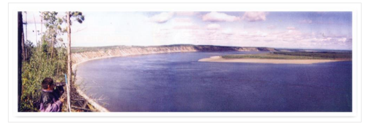
Fig. 9. Geological horizons of Mammoth Mountain

geological record, there is no equivalent surface exposure in the world. On Mammoth Mountain, from early spring to late autumn, there is a process of destruction and exposure along the whole length of the geological section (5-13 km). This process enables to discover unique research objects. On Mammoth Mountain, participants of expeditions are offered a one-day hike. Aan-Appa is a stream that flows into the Aldan River and forms the largest gorge on Mammoth Mountain. Since 1973, 12 remains of mammoth fauna have been discovered along this paleontological trail. Within a small section of the exposure, the young paleontologists found remains of mammoth, woolly rhinoceros, bison, tiglon, fossil deer, musk ox, elk, horse, and wolverine. In their search and research work the expedition members focus on studying the reasons of extinction of mammoth fauna animals. Unfortunately, there is no unified answer for it in the academic world. There are many mutually exclusive hypotheses.