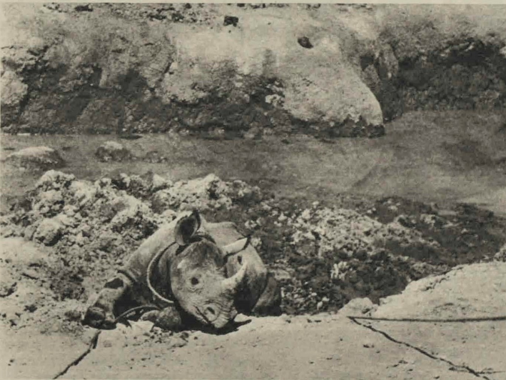
GRUNTING IN PROTEST AS THE ROPES SLOWLY PULLED IT FROM CERTAIN DEATH: THE RHINOCEROS EMERGING FROM THE WATERHOLE.