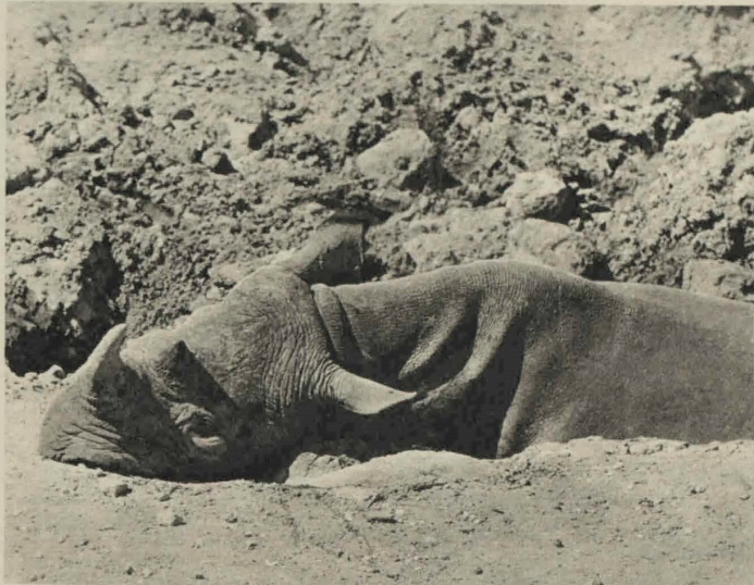
TRAPPED IN A DRYING WATERHOLE: THE RHINOCEROS WHICH, WHEN FIRST VIEWED BY ITS RESCUER, WAS DESPERATELY BEATING ITS HEAD AGAINST THE MUD.