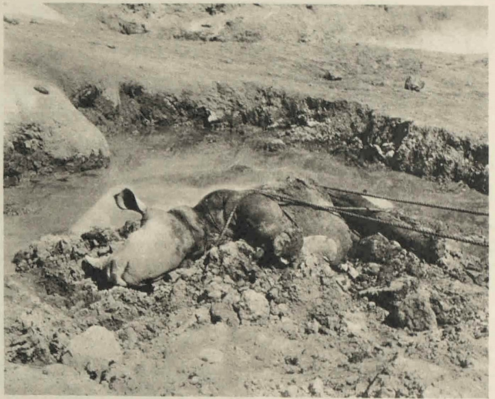
A TRICKY PART OF THE RESCUE OPERATION SAFELY ACCOMPLISHED: THE RHINOCEROS, WEIGHING OVER A TON, AS IT APPEARED AFTER A ROPE HITCH HAD BEEN SECURED AROUND ITS GREAT GIRTH.