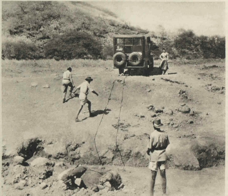
USING A HAWSER ATTACHED TO A HEAVY CAMERA TRUCK: THE RESCUERS PREPARING TO PULL THE STRANDED ANIMAL OUT OF ITS DEATH TRAP.