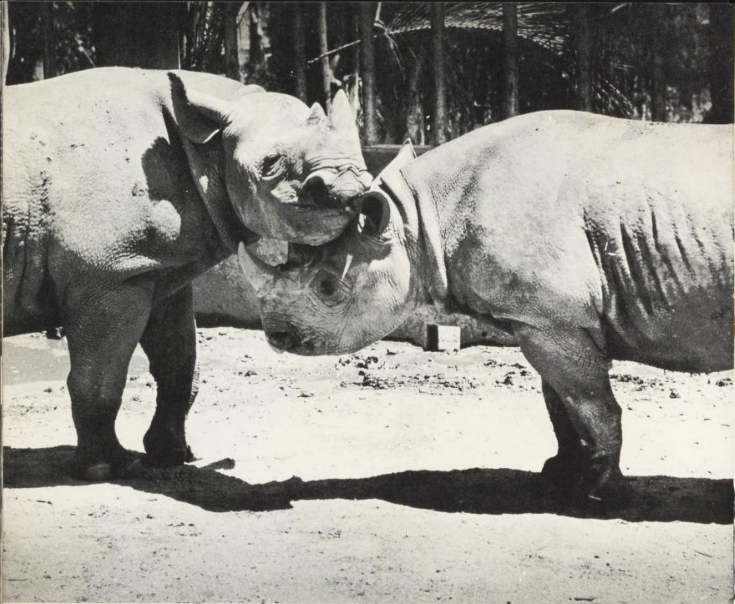
Sally and Barney, our African BLACK RHINOCEROSES , in one of their more affectionate moods.

muzzle that are composed of agglutinated hair. The Black or Hook-lipped Rhinoceros , now becoming rare but once common throughout Africa south of the Sahara, is characterized by a prehensile, pointed upper lip and by the presence normally of two horns, the front one usually being the longer. Rhinos feed entirely on vegetation. Despite their formid-