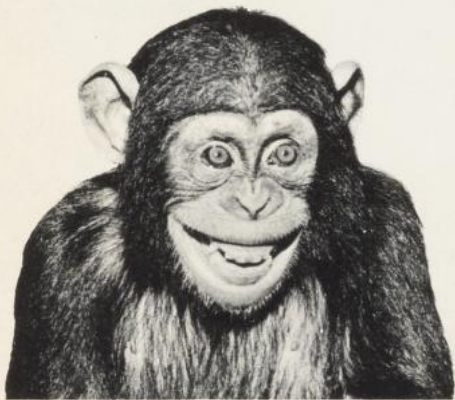
Banjo, the happy chimp, welcomes you to the Zoo.