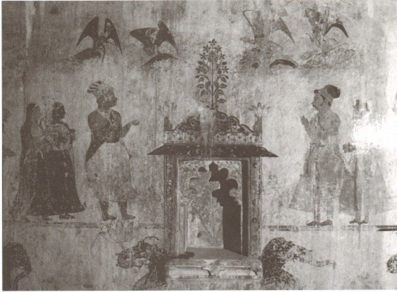
Fig. 1. Central part of the southern wall of the southern room of the so called "Hathiyaron ki Ori", Juna Mahal, Dungapur.