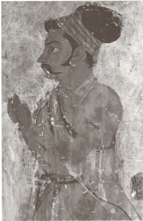
Fig. 2. Detail of fig. 1, showing a ruler who resembles Karna Singh of Bikaner.

Bikaner and Dungarpur do not mention a Dungarpur queen of Karna Singh – his appearance, style and fashion provides a clue to the date of the mural.