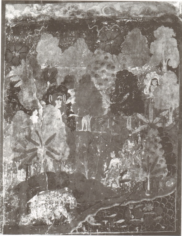
Fig. 5. Mural in the north-eastern corner of the same room as fig. 4.