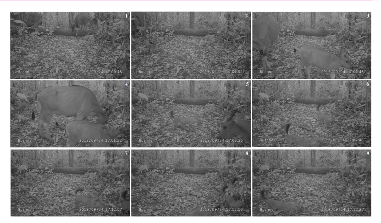
Image 2. Photographs of predation on a young Banteng by a pack of Dholes on 24 September 2013: 1—young Banteng accompanied by three adult females | 2—one individual Dhole starts attacking the Banteng | 3–5—an adult female Banteng tries to protect the young Banteng | 6–8—three Dholes are moving forward and attacking Banteng on the far side of picture | 9—another individual Dhole running moving forward on the same side.

et al. 2012). In Cambodia, although Dholes preferred Muntjac, a small-sized ungulate, they also regularly consumed Banteng (18% of diet), indicating Dholes are capable of sometimes preying on large-sized ungulates (Kamler et al. 2020). Similary, in Baluran National Park, East Java, Dholes were found to consume mostly largesized ungulates including Banteng and Water Buffalo Bubalus bubalis (Nurvianto et al. 2016). Thus, Dholes in Indonesia and other areas of southeastern Asia might be more likely to prey on large-sized ungulates compared to Dholes in India, where medium-sized ungulates are more common.