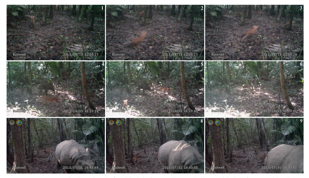
Image 3. 1–3—a Java Mouse-deer being chased by five adult Dholes | 4–6—Wild Pig attacked by two adult Dholes | 7–9—an adult male Javan Rhinoceros followed by three Dholes.