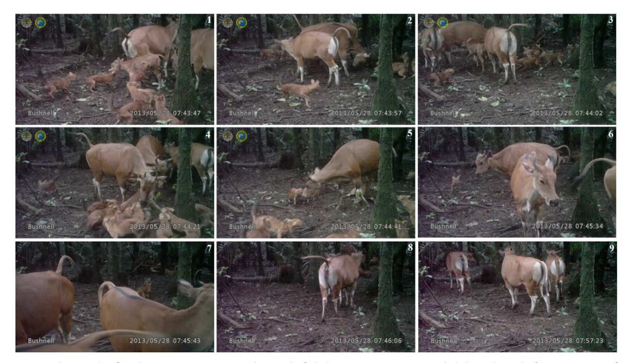
Image 1. Photographs of predation on a young Banteng by a pack of Dholes on 28 May 2013: 1—a Dhole bites the neck of a young Banteng | 2–4—an adult female Banteng tries to protect the young Banteng | 5—several members of the Dhole pack try to separate the young Banteng from an adult female Banteng | 6–7—Dholes kill a young Banteng on the far side of picture | 8—adult female Bantengs come back to try and save the young Banteng | 9—the process of predation by Dholes is complete which is marked by several pack members resting.

These photographs indicate that Dholes are capable of predating on large-sized ungulates such a Banteng, although probably mostly young of this species. A review of Dhole diets showed that their preferred weight range is 130-190 kg, and that the two most preferred species are Sambar and Chital (Hayward et al. 2014). These results are supported by research in India, such as in Nagarahole, which found Dholes usually prefer medium-sized prey (Karanth & Sunquist 2000), such as Chital Deer Axis axis and Sambar Deer Rusa unicolor (Karanth & Sunguist 1995). In India, Dholes were occationaly found to consume Gaur Bos gaurus, a large-sized ungulate (Johnsingh 1983; Karanth & Sunquist 1995; Hayward et al. 2014), indicating largesized ungulates are not common prey of Dholes in India. In Bhutan and Laos, Dholes were found to prey mostly on both medium and small-sized ungulates (Wang & Macdonald 2009; Thinley et al. 2011; Kamler