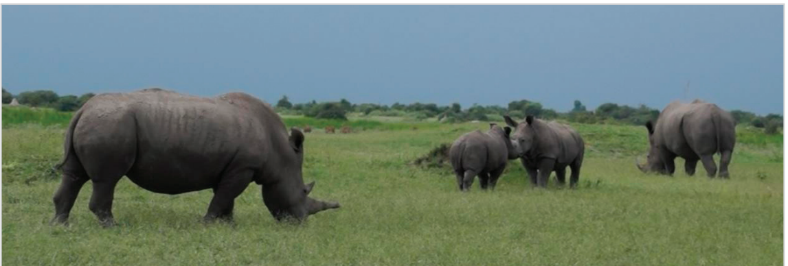
Figure 2. Observation of two adult female white rhinos at the same location and their male and female calves playing.