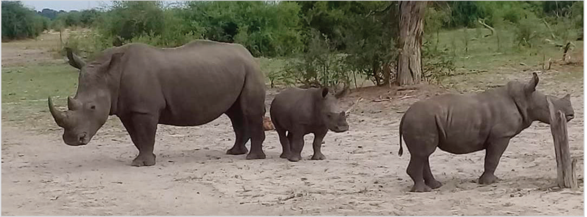
Figure 6. The calf on the right had been separated from its mother and stayed with the female on the left and her calf (middle) for about two days.