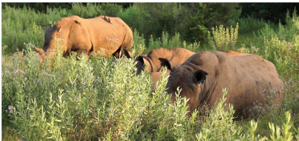
Figure 4. One adult male, two adult females and their calves resting together at the same location in the morning.