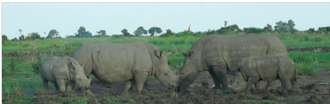
Figure 3. Two adult females and their female calves at the same location playing together; the females had also shown playful horn wrestling without aggressive vocalizations.