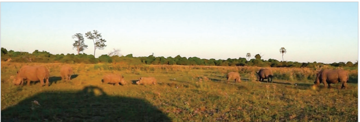
Figure 8. Group of four adults and three calves observed together at the same location nine days after dehorning.