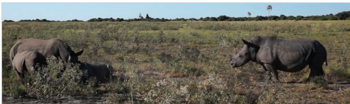
Figure 5. From left to right: male calf, his mother, female calf, her mother. The female calf lying on the ground had been drinking from the female on the left, although her biological mother is the rhino on the right. The male calf had at this time been playing with the female on the right, but then came up to his mother and started to whine loudly to be able to suckle as well.