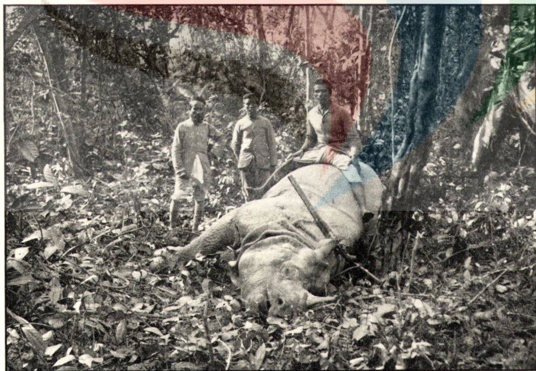
THE GREAT INDIAN RHINOCEROS