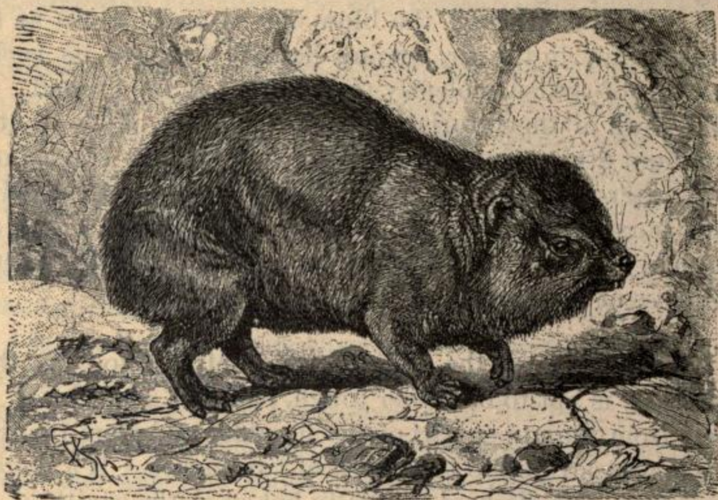
HYRAX, OR ROCK RABBIT. Hyrax habessinicus .

About as large as a tolerably sized rabbit, covered with thick, soft fur, inhabiting holes in the banks, possessing incisor-like teeth, and, in fine, being a very rabbit in habits, manners, and appearance, it was long classed among the rodents, and placed among the rabbits and hares. It has, however, been discovered in later years, that this little rabbit-like animal is no rodent at all, but is of one of the pachydermata, and that it forms a natural transition from the rhinoceros to the hippopotamus. On a close examination of the teeth,