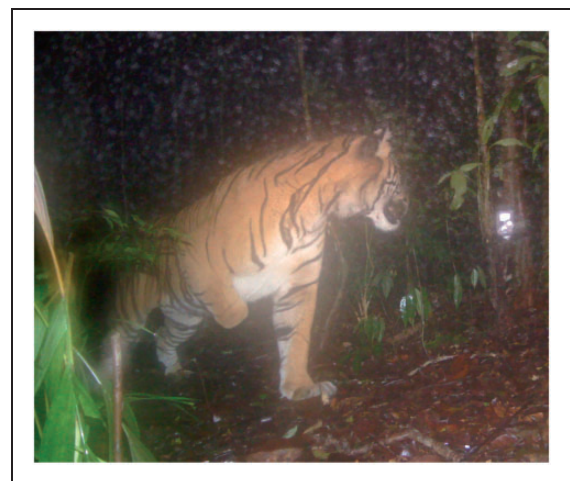
Figure 3. Camera-trap image of a wild, 3-legged Sumatran tiger taken on November 13, 2019 in an area frequented by poachers in the Ulu Masen Ecosystem. Eight days prior, on November 5, 2019, a community ranger patrol team dismantled 28 wire and steel snare traps in a 1 km 2 area of forest surrounding the location of this photograph. Also on November 5, 2019, we observed carcasses of one sun bear and one dhole, both killed by snare entrapment. Subsequently, a live 3-legged sun bear was photographed at the same location in January 2020. Severed limbs are a common indication of an animal's escape from snare entrapment; thus, both the tiger and bear were most likely crippled by these malignant traps.

Once FKL patrol teams discover snares installed in the forest, the species-or taxa - targeted by the hunter is ascertained by several characteristics such as snare material, diameter of the snare's noose, habitat type, and snare positioning. Whereas wire and nylon rope are typically used to ensnare ungulates, heavy-duty metal cables (e.g., 5–8 mm in diameter) are a tell-tale sign of traps set for tigers and bears. These large carnivores can chew through rope or sever such materials with sheer force; hence the use of thicker cables—usually constructed from steel—for their capture. Snare noose diameters