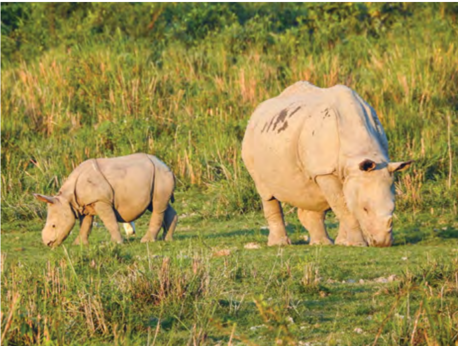
Greater One Horned Rhino