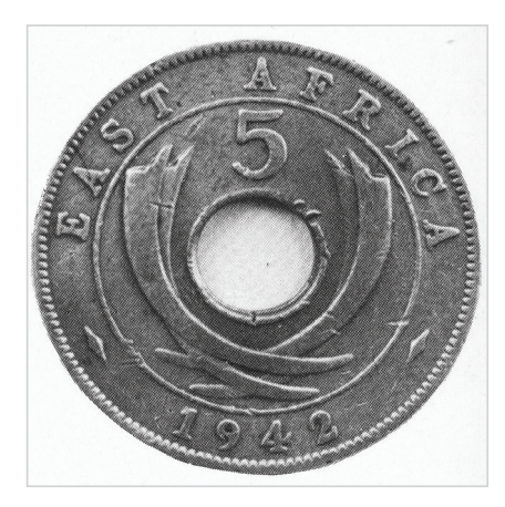
Figure 1. The better to make the point that coins were wealth they were embossed with ivory tusks.

therefore that the colonial powers monopolised ivory from the beginning of their administrations. In 1893 Lord Lugard representing the Imperial British East Africa Company's (IBEAC) rule in Uganda wrote, regarding the Kingdom of Toro: