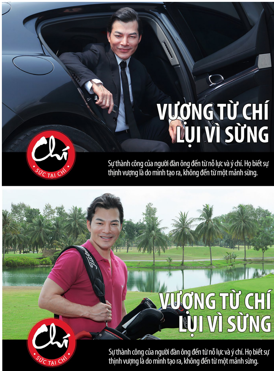
FIGURE 3 Ad 3, TRAFFIC's Chi campaign, Phase 2. The message translated to English is 'Gain prosperity through inner strength—Invite hardship using rhino horn. The success of men comes from their efforts and strength of will. They know their prosperity comes from themselves, not from a piece of horn' (Permission to reproduce this ad has been granted by TRAFFIC)

When shown the ad of the Be Smart campaign, five respondents recognized it, but only four remembered the hidden keywords (rhino horn; see Figure 5). Notably, respondents provided