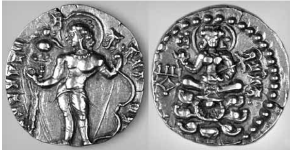
Fig. 11.7a–b. Archer Type, National Museum, New Delhi, acc.no. 51.50/73.

the bird is closely similar. The circular legend shows the familiar, relatively big, letters. They came only partly on the flan in the single coin documented so far. Altekar reconstructed the verse on this unique coin (Bayana hoard no. 1375) as jayati mahītaṃśrī kumāraguptaḥ , to be read from VIII o'clock onwards.