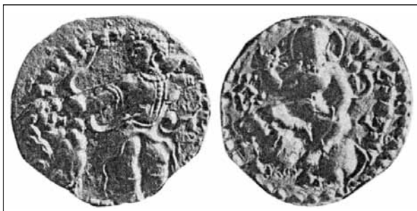
Fig. 11.5a–b. Lion-slayer Type, Bayana hoard, thence in Bharatpur Palace coin cabinet.