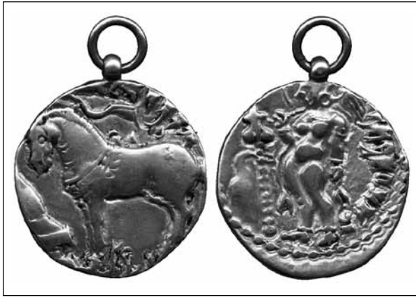
Fig. 11.1a–b. Aśvamedha Type, Private collection.

iconographies prove more popular than others. These different styles are the focus of this paper for my room matey Doris Srinivasan. The discussion has been organised into two parts: first I will examine into detail the history of the gradual discovery of styles in Gupta coins in the course of the 20th century. Subsequently, I will focus on one particular group of coins from the time of Kumāragupta I that share a particular style. I will argue that they were all produced at the same mint in approximately the same period under Kumāragupta. They form part of two closely related groups labelled Mint Groups 7 and 8 in my ongoing mint-idiomatic analysis. I aim to show how a study of styles such as evident in the coins of these two groups may help us to understand both the diversity in the corpus of Gupta gold coins and their underlying coherence.