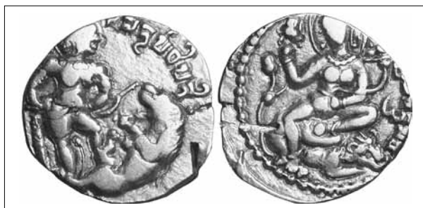
Fig. 11.3a–b. Lion-slayer Type, Pankaj Tandon [Col.pl. 3].

A similar coin, in Tandon's own collection, was struck from a different pair of dies, as is evident from the lower positioning of the lion, from the position of the king's bow, from a slightly different circular legend on the obverse (which contains the title " nṛpādhipatiḥ " 24 ) and from different attributes of Śrī (Fig. 11.3; Col.pl. 3). In her right hand she holds a lotus, which rises on a thin and winding stalk in the left field. The pericarp is turned towards the face of the goddess. In her left hand she holds the thin stem of what looks like a wide-open flower with three distinct seed-boxes rising up in a row. This does not at all look like the padma usually held