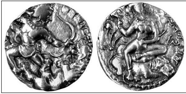
Fig. 11.4a–b. Lion-slayer Type, State Museum, Lucknow, acc.no. 11594.

left field. Coins of the later imperial Gupta kings do not carry it. For these reasons I prefer Tandon's alternative explanation, viz. that śrī is the first part of the king's epithet. Our mint-idiomatic analysis supports this, as I will show.