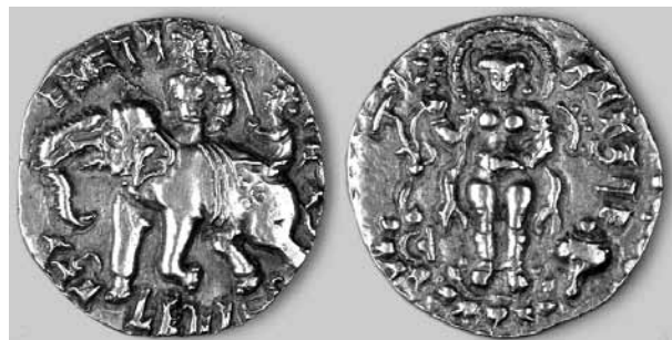
Fig. 11.11a–b. Elephant-rider Type, National Museum, New Delhi, acc.no. 51.50/53, from the Bayana hoard.