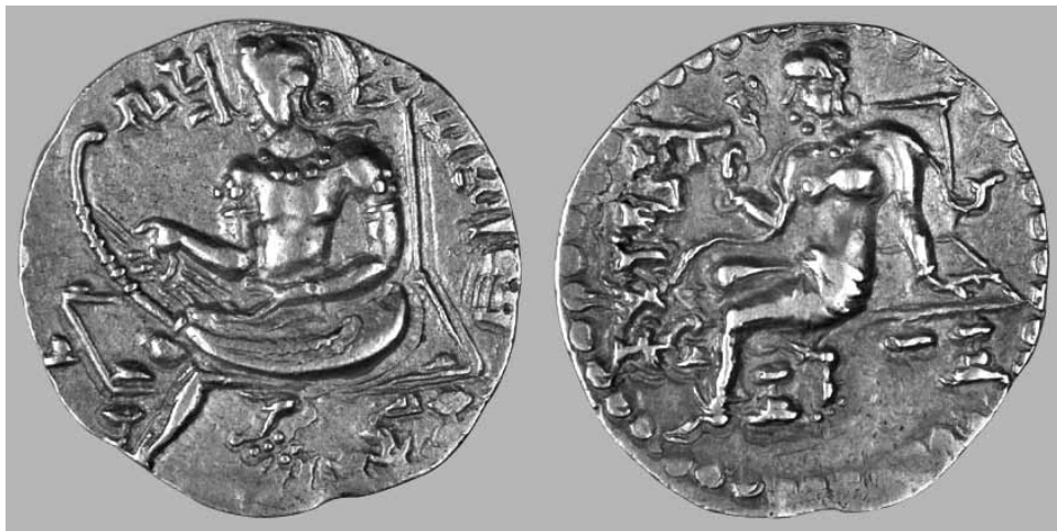
Fig. 11.13a–b. Lyrist Type, National Museum, New Delhi, acc.no. 51.50/50, from the Bayana hoard.

On Samudragupta's Lyrist coins, the lady on the reverse has a nimbus and sits on a wicker stool. She holds a fillet and a lotus, and is always identified as Śrī. On Kumāragupta's Lyrist coins, the lady is not nimbate, and she sits on a low seat with a backrest. For these two reasons, Altekar suggested that she is not a goddess but the queen sitting at ease in the