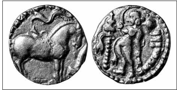
Fig. 11.14a–b. Aśvamedha Type, British Museum, London, acc.no. 1894,0506.962.

Several visual characteristics of the ultra-expensive Aśvamedha coin auctioned at Baldwin's (Fig. 11.1) suggest that this type too deserves a place in the mint-idiomatic ensemble considered here. Some have criticised Kumāragupta's die engravers for not matching the equine imagery of Samudragupta's Aśvamedha Type, but undeservedly in my view. The beautifully proportioned horse stands to left, tied to the sacrificial stake ( yūpa ) which rises from a two-tier, square platform. A fillet secured at the top of the yūpa flies to the right above the horse. It has sharply forked ends. The horse wears an ornamental breast cloth tied with a fillet. Faithful to the original design, the letter si (possibly standing for siddham , "prosperity") appears below the horse, here close