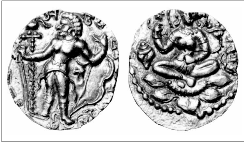
Fig. 11.6a–b. Archer Type. State Museum, Lucknow, acc.no. 11590.