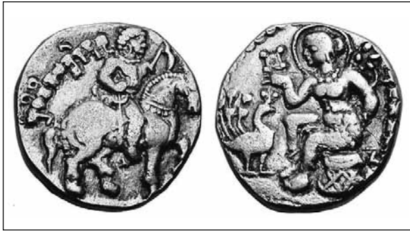
| Fig. 11.9a–b. Horseman Type, Private collection.

a different shaping. It prefers slightly angular and sharp profiles, heads and postures over more curvaceous ones. The virtual framing formats for the king on horseback or the goddess seated on her wicker stool appear somewhat flattened. We may notice, for instance, the victorious pose that Kumāragupta assumes after shooting the lion – hands placed on the hips, the shoulders raised, elbows pressing outwards, the face to the right in side-profile view, with hook nose and pointed chin emphasising a more overt angularity and slight stylisation of the portrait (Fig. 11.2a). Such changes in the stylistic visuality of coin workmanship under Kumāragupta I have evoked different responses in scholars. Vincent Smith resented these changes, as the resultant designs no longer complied with the ideal of smooth linearity. Others have complimented the mint masters of Kumāragupta I for the artistry of their coins. It seems, however, that