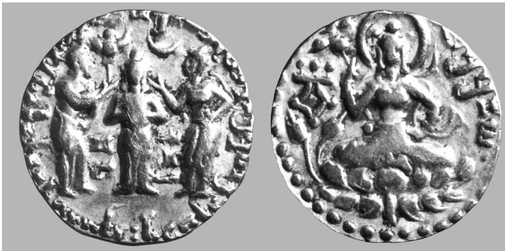
| Fig. 11.15a–b. Apratigha Type, State Museum, Lucknow, acc.no. 11403.

On either side of the central figure appears part of a name – kumāra on his left and gupta or guptaḥ on his right side. The characters have been carved on a vertical plane; the first half of the legend runs from top to bottom, the second half in the opposite direction. Most scholars are convinced that here the king is shown abdicating his throne in order to become a mendicant. 50 However, this is no mendicant, but a young prince. 51 He folds his hands together in respect for the man on his right offering him the dynastic Garuḍa-banner and the lady on his left gesturing. They probably represent his royal parents. 52 It has been suggested that the man with the Garuḍa-banner holds a shield in his left hand, but more likely it is another instance of the rather awkward and angularly bent positioning of the left arm and hand as also seen on a particular, related Lion-slayer coin discussed above and illustrated in Fig. 11.2a. The shaping and placement of the characters in the circular legend (so far unread) are also comparable to those in that particular Lion design.