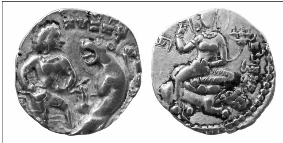
Fig. 11.2a–b. Lion-slayer Type, State Museum, Lucknow, acc.no. 11586.

left hand below, but I agree with P.L. Gupta that the goddess holds a second attribute in the opposite hand, though definitely not a skull garland. It looks like a thin beaded string passing across her right wrist and through her fingers. Perhaps it represents the short stem of a flower that did not make it to the flan. The facial features of the slender goddess, with high, round breasts, have worn away.