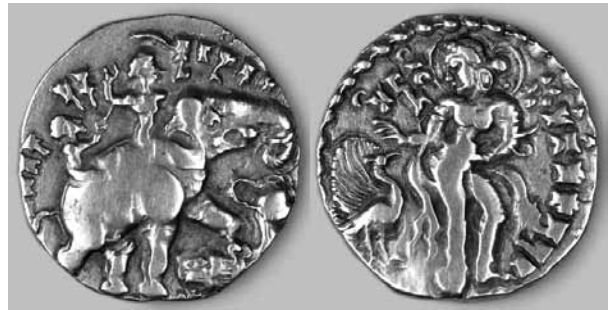
Fig. 11.12a–b. Elephant-rider-Lion-slayer Type, National Museum, New Delhi, acc.no. 51.39/43, ascribed to the Bayana hoard [Col.pl. 4].

In a related design, again exclusive to Mint Group 7 so it appears, the king rides to right on his elephant, accompanied by an attendant holding a parasol (Fig. 11.12; Col.pl. 4). 45 Until the discovery of the Bayana hoard, this type was only known through a cast of a coin that had vanished subsequently. The king raises his right hand into the air; his left hand is not visible. Notice how, as in the image of Śrī on the related Rhinoceros-slayer design (Fig. 11.10b), the hand is rather stylised and shows mostly a thumb and the profile of one finger. The king’s sharp facial features stand out in profile, and so does his lank body. The shape of his mouth varies, with lips either curved up or emphatically curved down in a