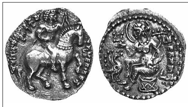
Fig. 11.8a–b. Horseman Type, Baldwin's Auction 26 (9 May 2001), Lot 1013.

The designs for these particular Horseman coins exemplify, even more than the related Lion-slayer and Archer designs, a gradual shift towards