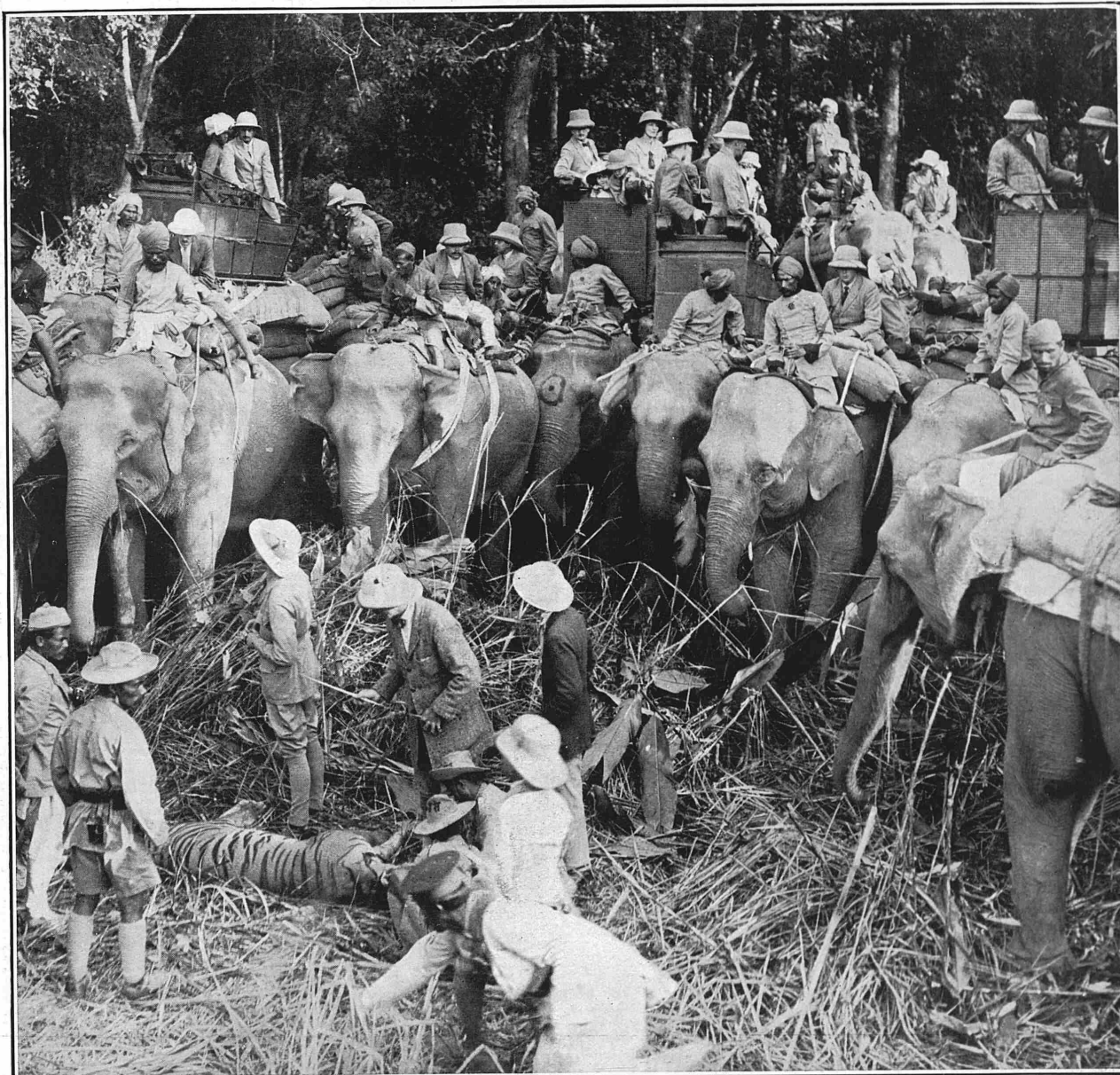
THE "KILL": THE HUNTERS—THE PRINCE ON THE THIRD ELEPHANT FROM RIGHT—GATHERED ROUND THEIR QUARRY

During his week's big game hunting as the guest of the Maharaja dhiraja of Nepal, the Prince of Wales and his party had splendid sport in the forests. Not only did the Prince kill his first tiger and first rhinoceros, but he had the exciting experience of hunting other beasts of prey such as leopards and