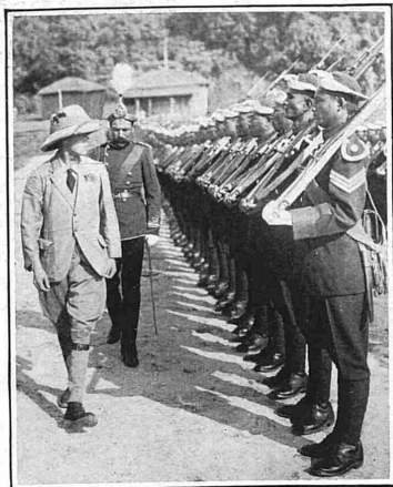
INSPECTING A GUARD OF HONOUR of Nepalese troops on the Nepal frontier.