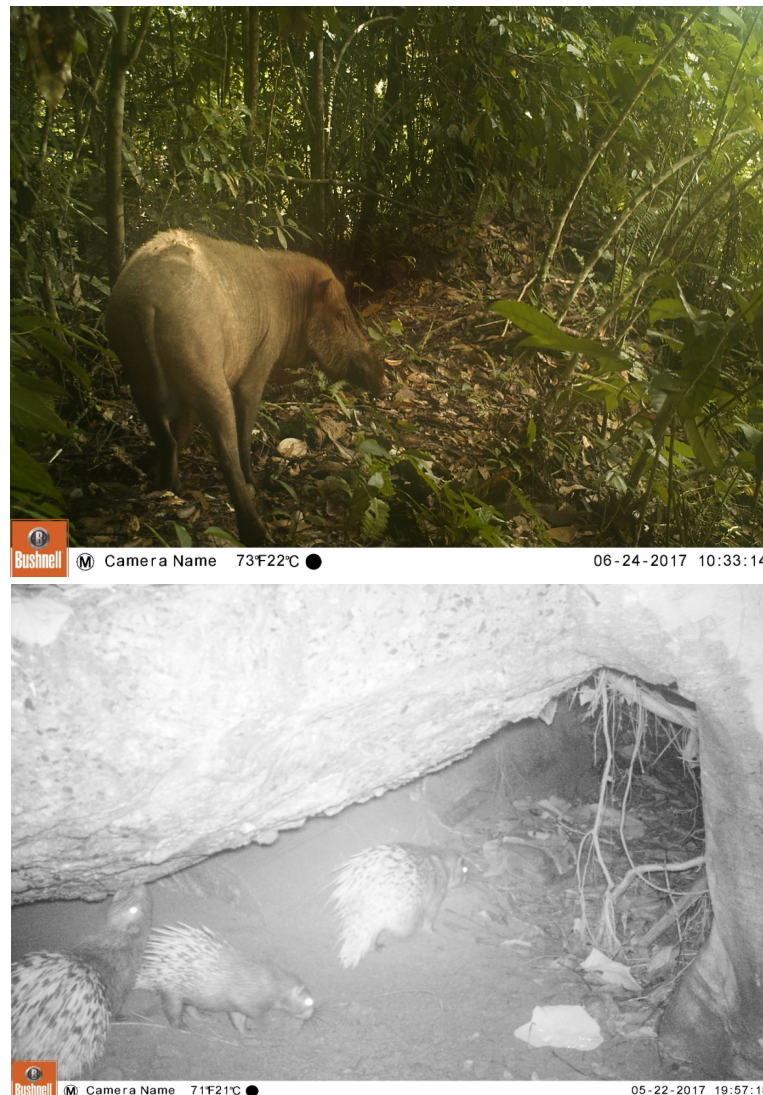
Figure 2. A bearded pig (above) and Malayan porcupines (below) were recorded by camera traps