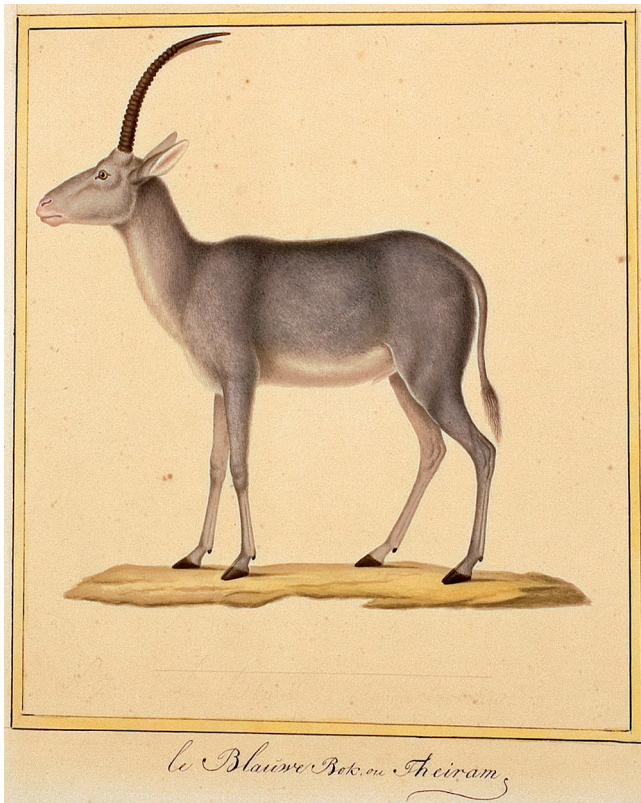
FIG. 5. — Illustration of Levallant's Bloubaok. Library of Parliament, South Africa. Courtesy of the Library of Parliament.