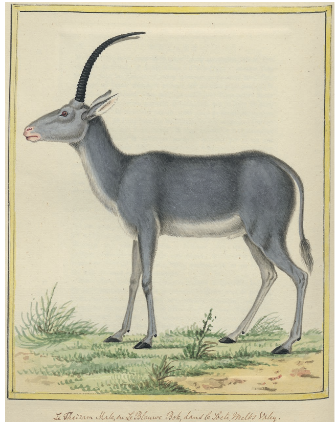
FIG. 6. — Illustration of Levallant's Bloubaok. University of Leiden Library.

or about 110 cm (Fig. 4). Renshaw in his measurements of the Paris specimen says it was 45 inches or about 114 cm at the withers (Renshaw 1901). Mohr gives two measurements for the withers in Paris: Stockmaß as 111.5 and Bandmaß as 120 (my own measurement, excluding the hoofs, was 112 cm). In any event, she does not consider the Gordon measurement at all or account for the discrepancy. It seems also that Gordon included the hoofs in his measurement whereas modern measurements tend not to, so that the height might be greater than 112 cm. Levallant unfortunately never gave any measurements of his animal.