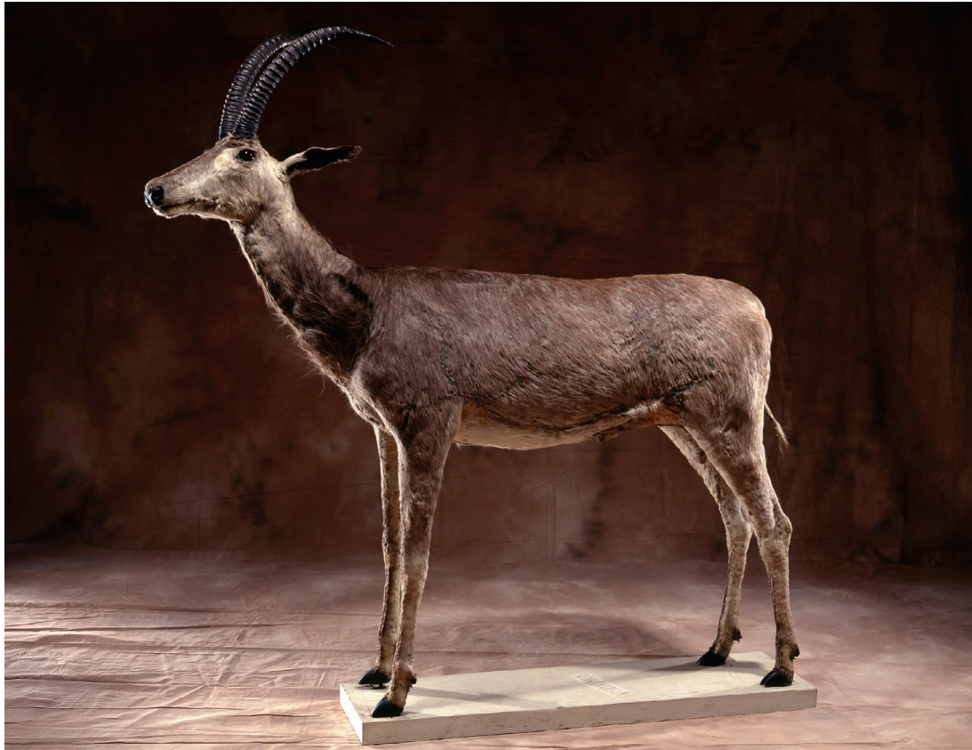
Fig. 1. — Photograph of the Paris specimen of Hippotragus leucophaeus (Pallas, 1766).

None of the many accounts of the animals taken from the Netherlands by the French lists the Bloubok and the archival evidence here again is lacking (Boyer 1971, 1973; Lacour 2009; Lipkowitz 2014). Though absence of evidence is not evidence of absence, the Levaillant provenance by contrast does have a strong archival paper trail.