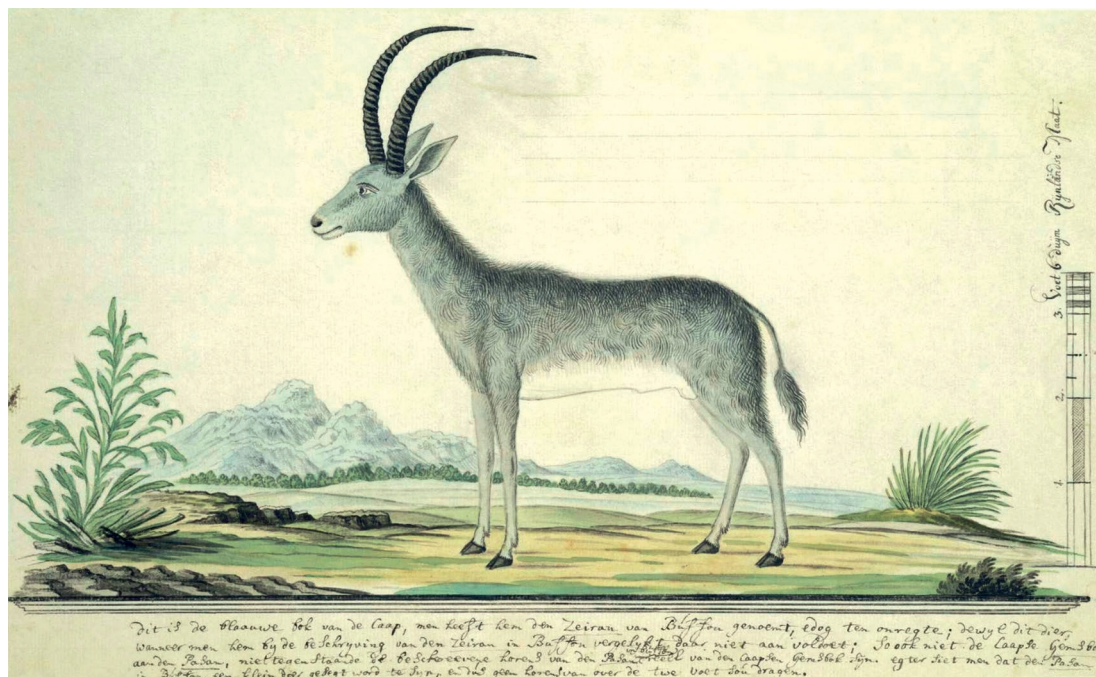
FIG. 4. — Gordon illustration of the Bloubok.

France – something he comments on angrily in his description of shooting a wounded eagle on the Plain of Gennevilliers near his home in Asnières (Levaillant 1802: 7-8). The Bloubok was one of the first antelope he shot for purposes other than meat and it seems he simply did not have the knowledge to skin it for mounting himself or supervise the hunter who, presumably, cut up the animal in ways that would have produced meat and perhaps pieces of skin for traditional Khoi usage.