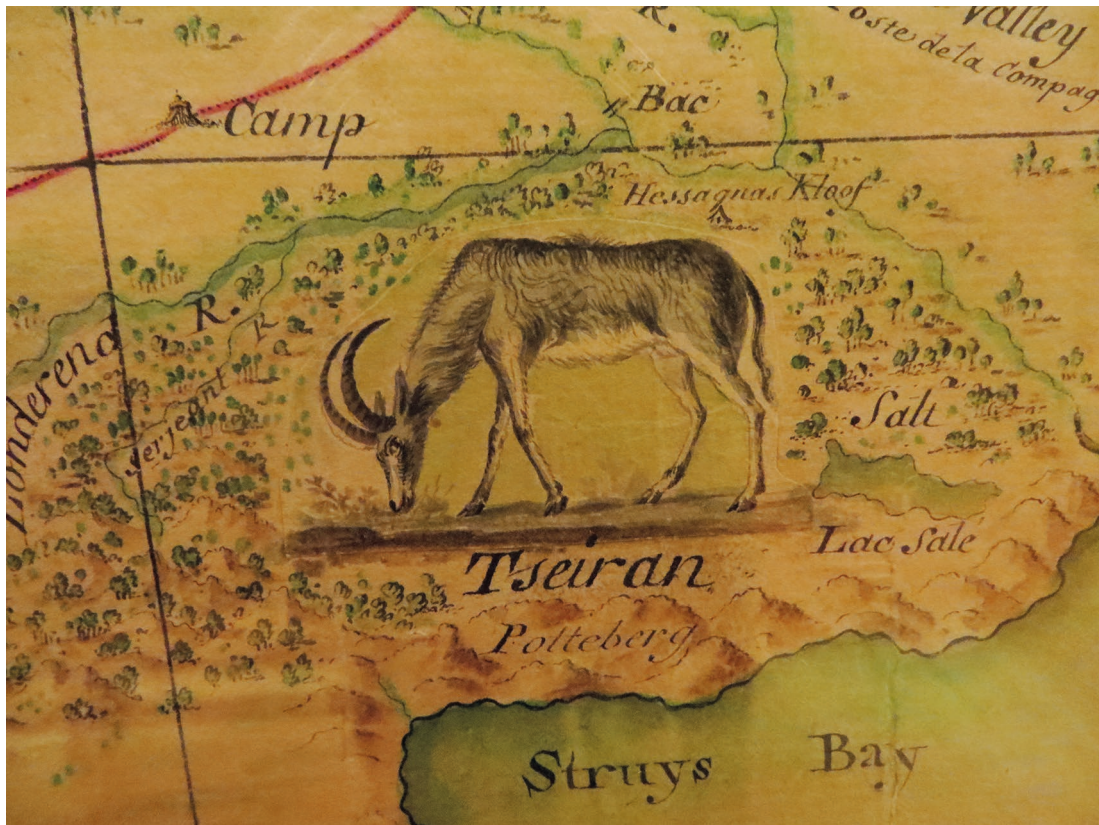
FIG. 7. — Detail from the De Laborde map showing the Bloubok.

What of the grazing Bloubok depicted in one of the very small ‘papillons’ or inset illustrations on the King’s Map? (De Laborde 1790; Fig. 7). Did the artist here, known to be Willem van Leen, base this reconstruction of the animal on Levaillant’s description or a specimen? The proportions are very similar to those in Levaillant’s other illustrations and in the Paris specimen. The head and ears are slightly longer than the horns, while the distance from withers to tip of nose is nearly as long as the distance from withers to base of tail.