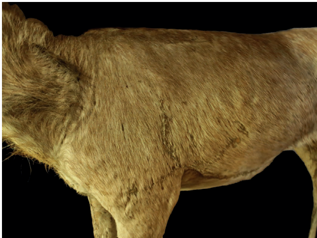
FIG. 2. — Photo of cut marks on the Paris specimen.