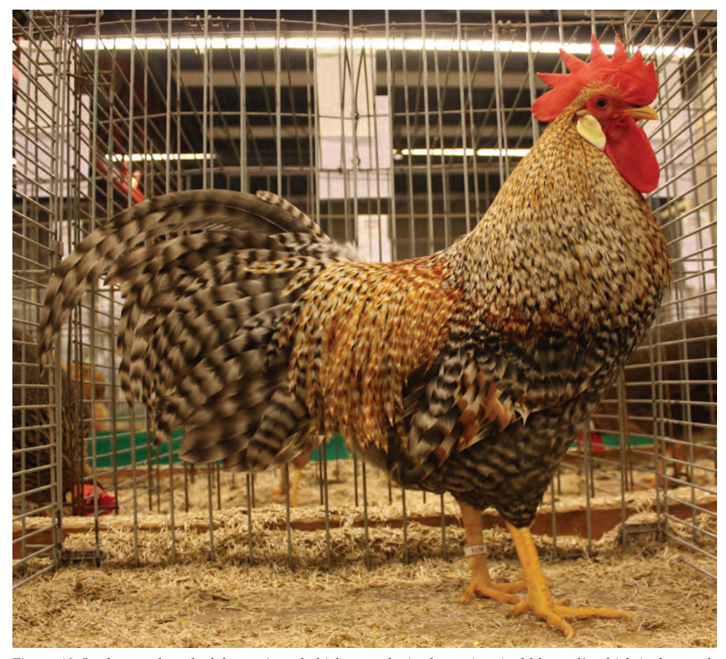
Figure 13. Leghorn, a breed of domesticated chicken, male, in the variety 'gold barred', which is the result of the effect of sex-linked barring alone, without any other mutation; as sex-linked barring affects eumelanin (black) more than phaeomelanin (reddish brown), the alternating pale and coloured transverse bars are less conspicious in the 'golden' parts of the plumage; compare this bird with the specimen in Fig. 11 (© Aad Rijs)

Society (Anon. 1857, Darwin 1857, Tegetmeier 1857). Their current whereabouts, if they still exist, are unknown to us.