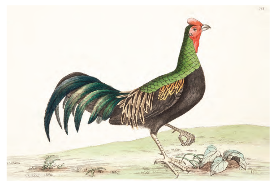
Figure 1. Pl. 353, Variegated Pheasant Phasianus varius in Shaw 1798