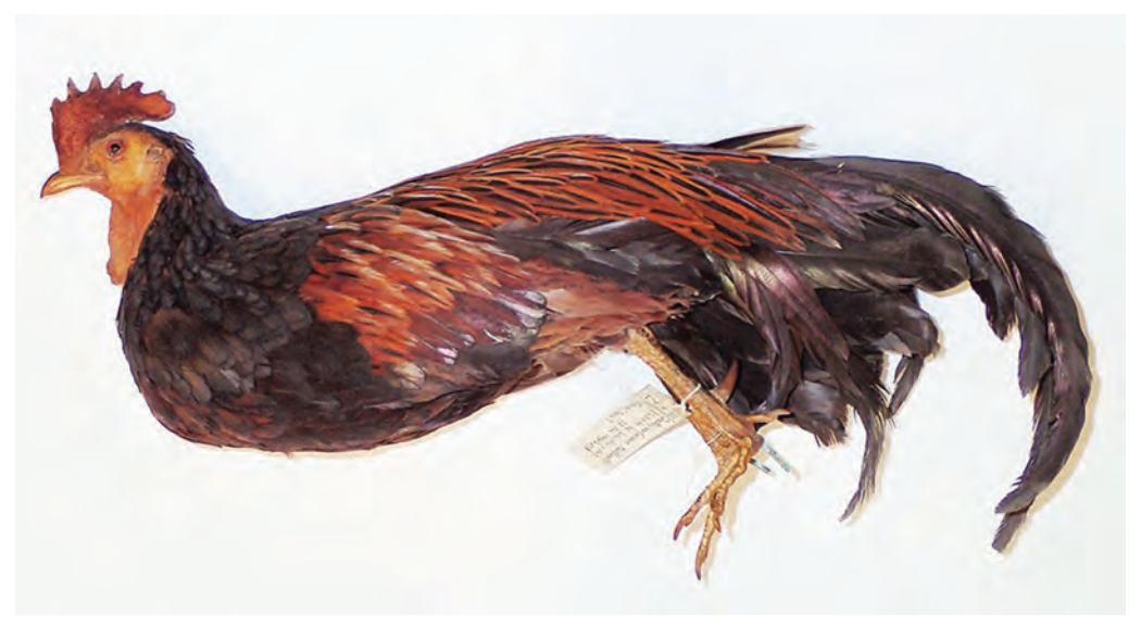
© 2019 The Authors; This is an open-access article distributed under the terms of the Creative Commons Attribution-NonCommercial Licence, which permits unrestricted use, distribution, and reproduction in any medium, provided the original author and source are credited.

Figure 10 (below). Holotype of Gallus violaceus Kelsall, 1891 (ZRC 3.30131); at the time of description, 1891, this bird was still alive in the Singapore Botanic Gardens, but after it died was donated to the, then, Raffles Museum