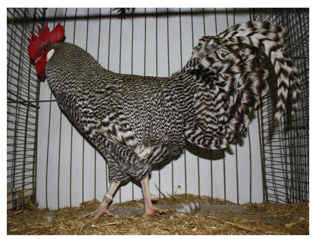
Figure 12. German Cuckoo, a breed of domestic chicken, male, in the traditional cuckoo pattern, commonly referred to as 'barred' by chicken fanciers, which is the combination of two different mutations; Black (gene symbol E), a dominant mutation which turns the wild type colour solid black, and sex-linked barring (gene symbol B) which switches the production of melanin on and off during feather growth, resulting in alternating pale and coloured transverse bars over the length of each feather

These Bornean skins were probably those that Darwin encouraged Tegetmeier to exhibit, together with those of other Asiatic domestic fowl, at a meeting of the Zoological