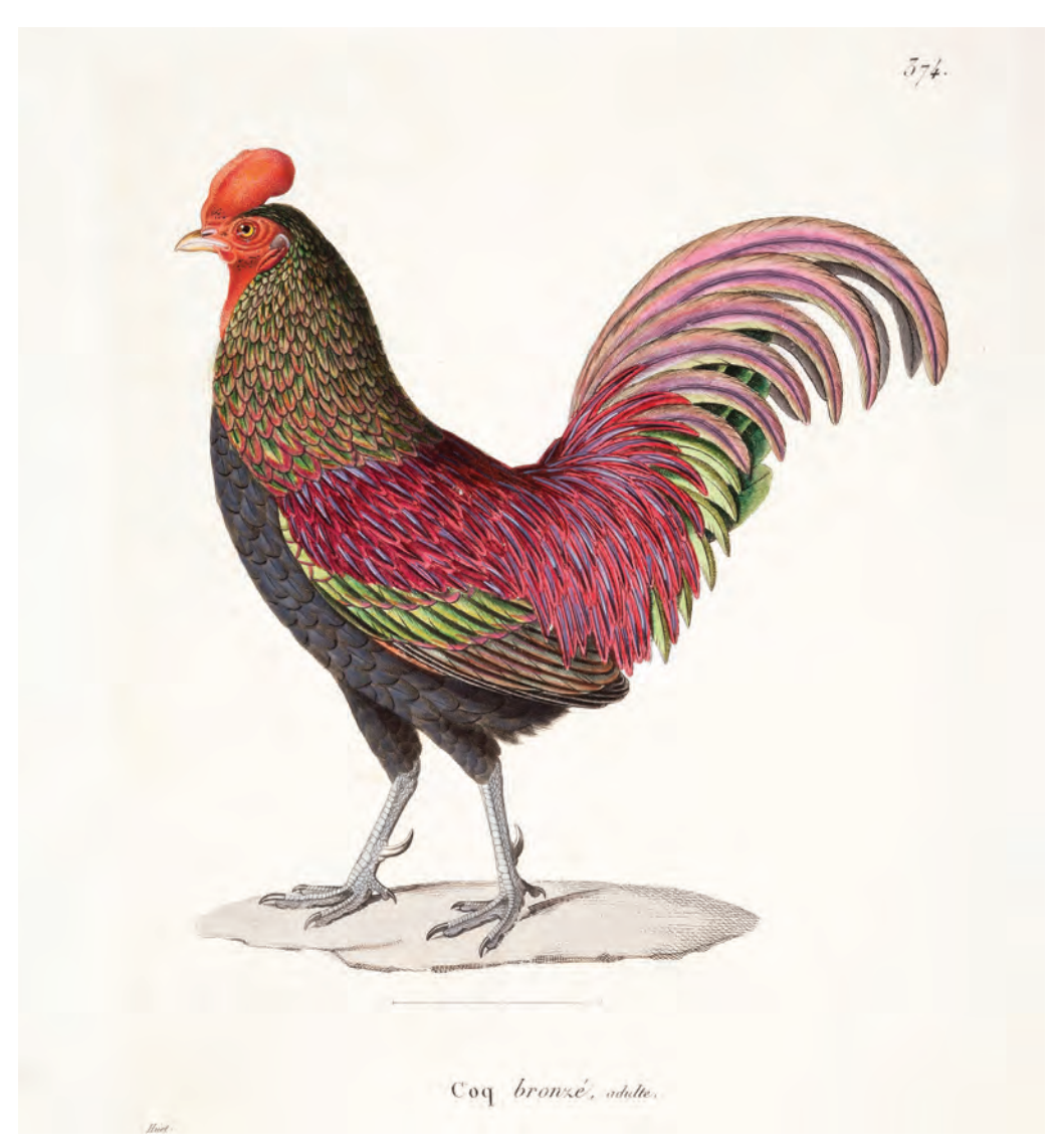
Figure 6. Lithograph of Gallus aeneus, 'the Bronzed Cock', pl. 374 in Temminck's Planches coloriées (1825); the lithograph was after a drawing by the French natural history illustrator Nicolas Huet le Jeune

Museum. The English explanation (Raffles 1822, Raffles 1830: 372–373, 702–723), however, was that all the collected material belonged to the East Indian Company as the latter paid the collectors a monthly salary for their work, but that nevertheless the French had secretly sent many objects to Cuvier in Paris, including their notes and drawings. Whatever the truth, Diard and Duvaucel did send specimens to France, including this cock supplied to the Paris museum by Diard during his stay in Bangkok (Voisin et al. 2015).