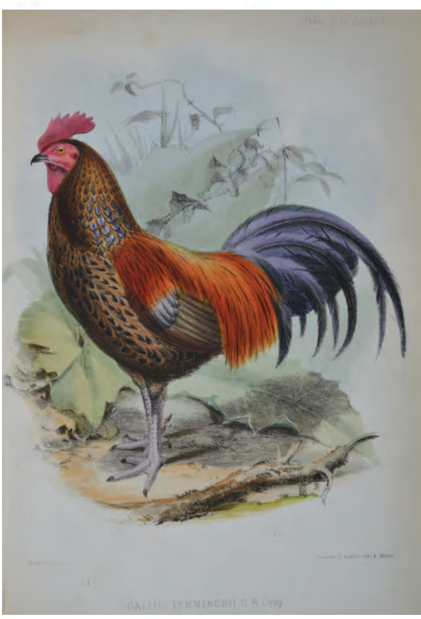
Figure 8. Engraving by Joseph Wolf (1820–99) of the holotype of Gallus temminckii , in Gray 1849