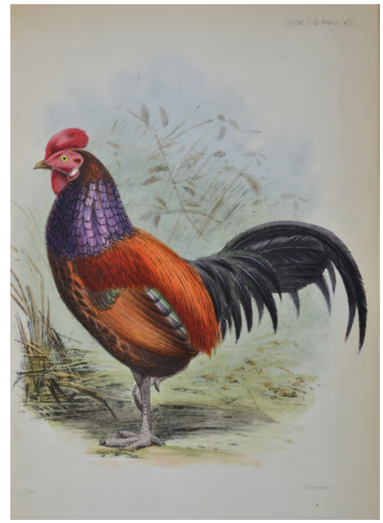
Figure 9 (left). Engraving by Joseph Wolf of a hybrid junglefowl similar to Gallus aeneus , which was present in the London Zoological Gardens at the time, in Gray 1849

Figure 10 (below). Holotype of Gallus violaceus Kelsall, 1891 (ZRC 3.30131); at the time of description, 1891, this bird was still alive in the Singapore Botanic Gardens, but after it died was donated to the, then, Raffles Museum