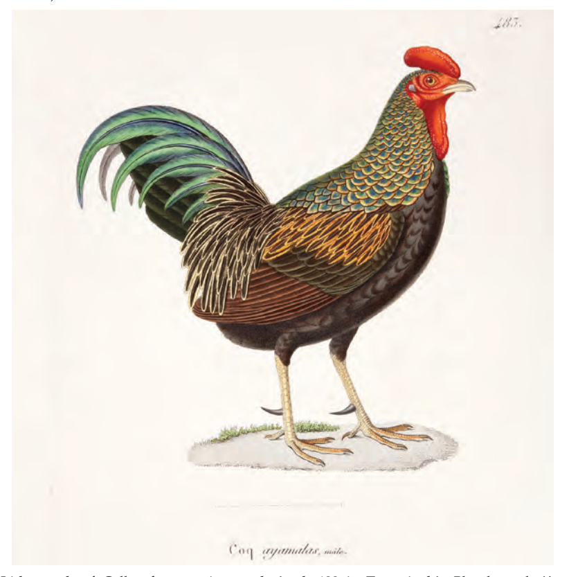
Figure 2. Lithograph of Gallus furcatus , 'ayam-alas', pl. 483 in Temminck's Planches coloriées (1829); the lithograph was after a drawing by the French natural history illustrator Nicolas Huet le Jeune (1770–1830)