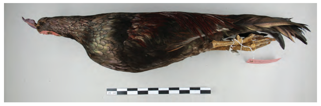
Figure 5. Holotype of Gallus aeneus Temminck, 1825 (MNHN.ZO.2013.42), collected by Pierre-Médard Diard between December 1818 and August 1819 on Sumatra

as such (Voisin et al. 2015). The specimen was first figured, together with his description, in Temminck's Planches coloriées (1825, pt. 63, pl. 374; see Fig. 6).