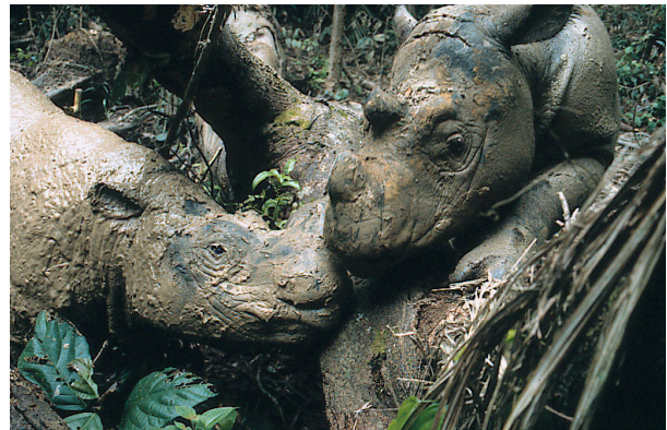
Image 3. In contrast to decades of unreliable surveys, direct observation and analysis has been the only source of relevant information for productive management.

After 25 years of perfecting tools and techniques in captivity, the Sumatran Rhino Sanctuary (SRS) design in Way Kambas is currently the only option for successful reproductive management of Sumatran Rhinos. Only in this environment can the essential management information be obtained, and reproduction optimized. Fertility monitoring for this species requires confirming