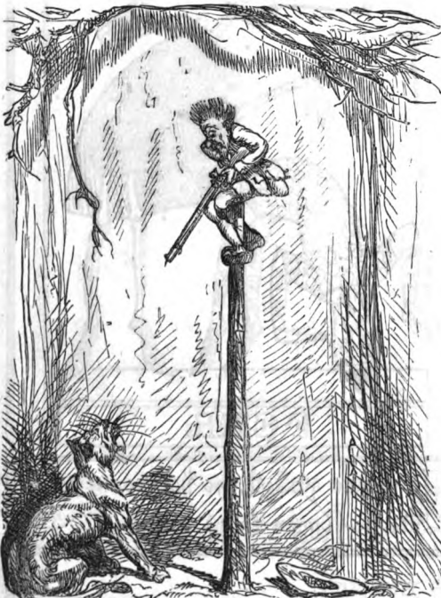
To Cracker's intense dissatisfaction, who makes a point of getting out of the way.