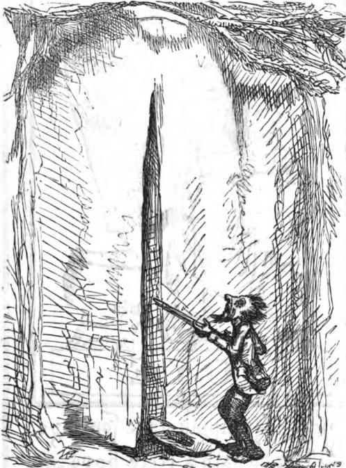
Cracker, while out shooting in Central Africa, tumbles into a native pitfall.

Being the Adventures of Cornelius Cracker, Esq.