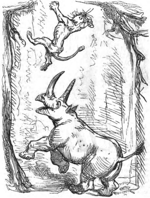
And gives the lioness a lift.