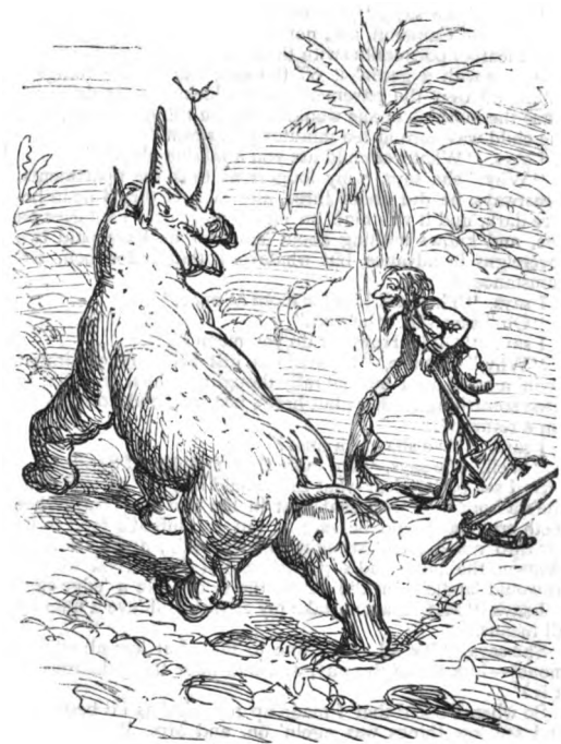
" Oh, does not a parting like this make amends?