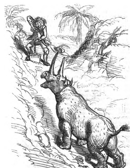
The grateful Cracker procures a spade, and fills in the pit, in order to release the rhinoceros.