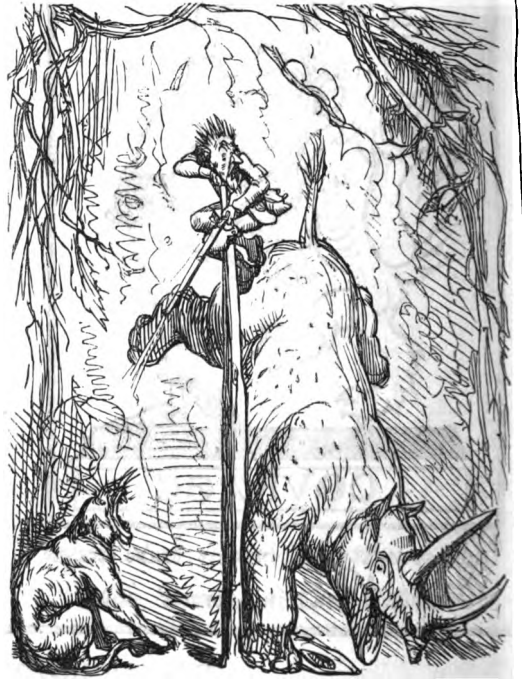
Another arrival. Cracker thinks it would be well to put up a notice—"Pit full."