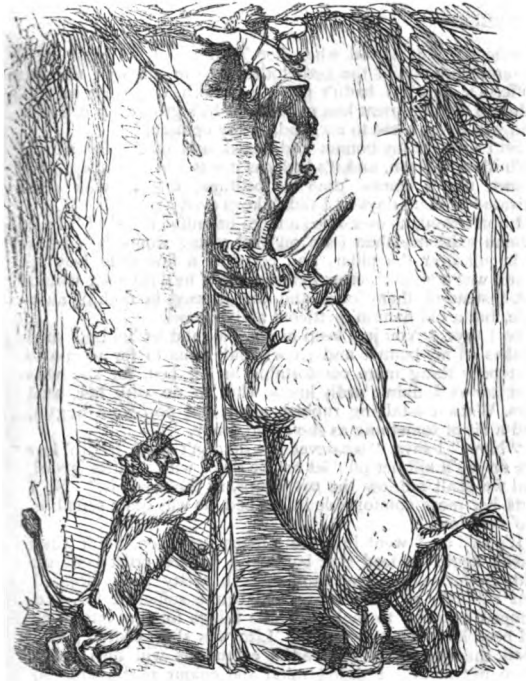
An alliance offensive and defensive is entered into. The rhinoceros assists Cracker out of the difficulty,