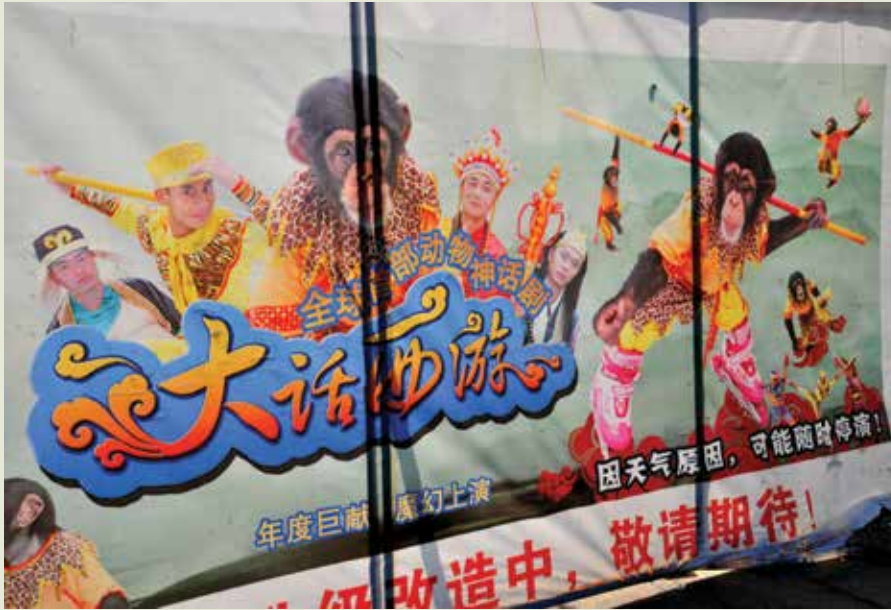
Current investigations have highlighted the trade in live chimps to Chinese circuses.