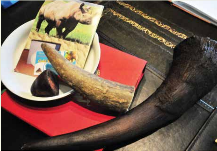
Karl's recent investigations led to exposing the demand for whole rhino horns by wealthy Vietnamese.

by wealthy Vietnamese. Powder from the horn was offered to guests as a detoxifier at parties and used to bribe officials (see SWARA July-September 2012). From one simple unrelated contact a whole new and developing market was uncovered and found to be the main reason behind the spike in rhino poaching in Africa.