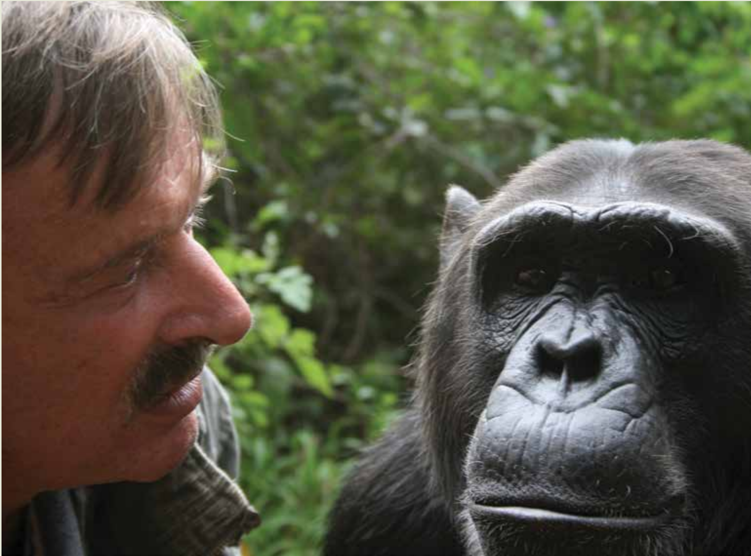
Top and below: A trip up the Congo river led to decades of investigating the bushmeat trade and rescuing distressed chimps.