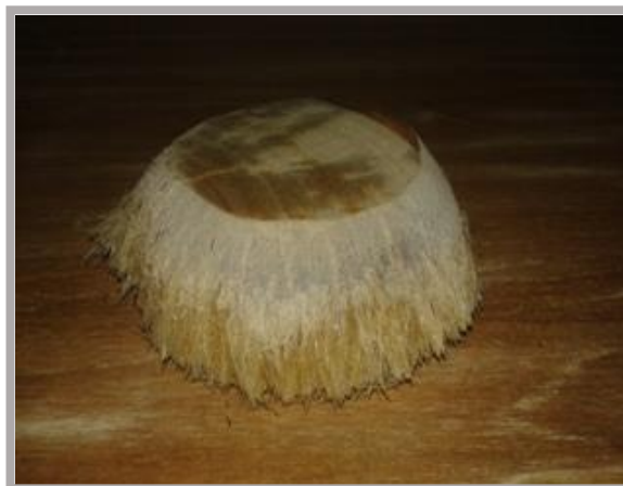
A trial product: stub of the first physically created rhino horn

In conclusion: it is a determining factor to negotiate as soon as possible a solid contract between rhino countries and main consumers: China and Viet Nam. However, such a document cannot materialize, based on authentic rhino conservation, if the negotiations are left just to governments without an unbiased and strong mediator. The bureaucracy's management and control, in a skilful manner, are indispensable to achieve the long-term survival of the rhinos.