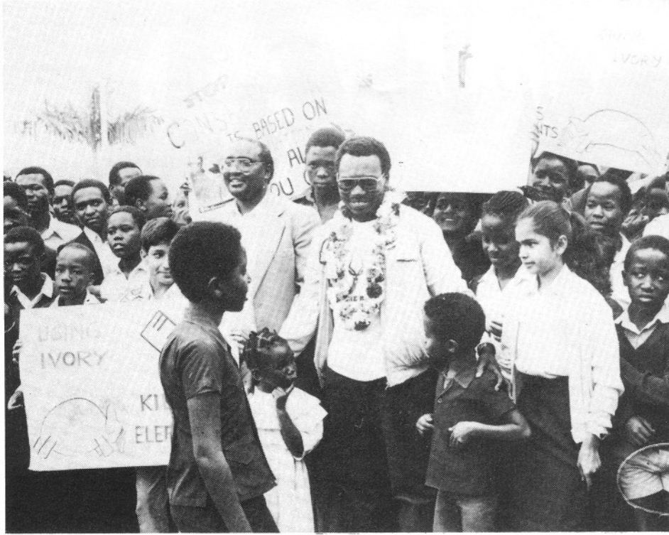
The welcome home.