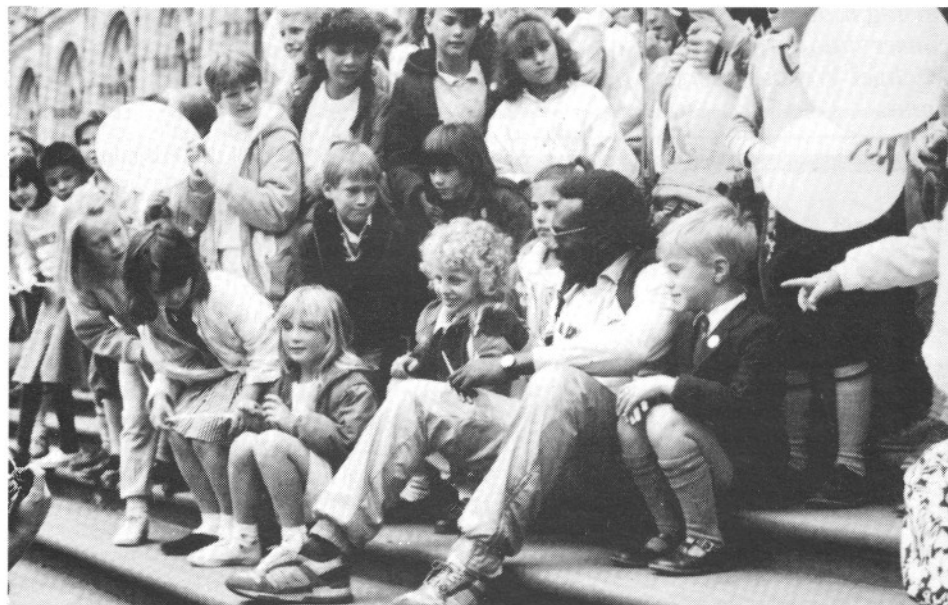
Surrounded by school children on the steps of the British Museum of Natural History.