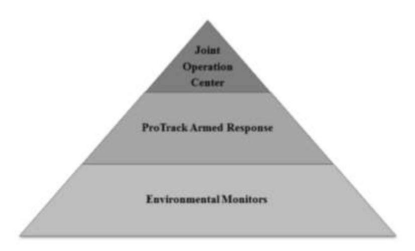
Figure 2: Balule Rhino Conservation Model